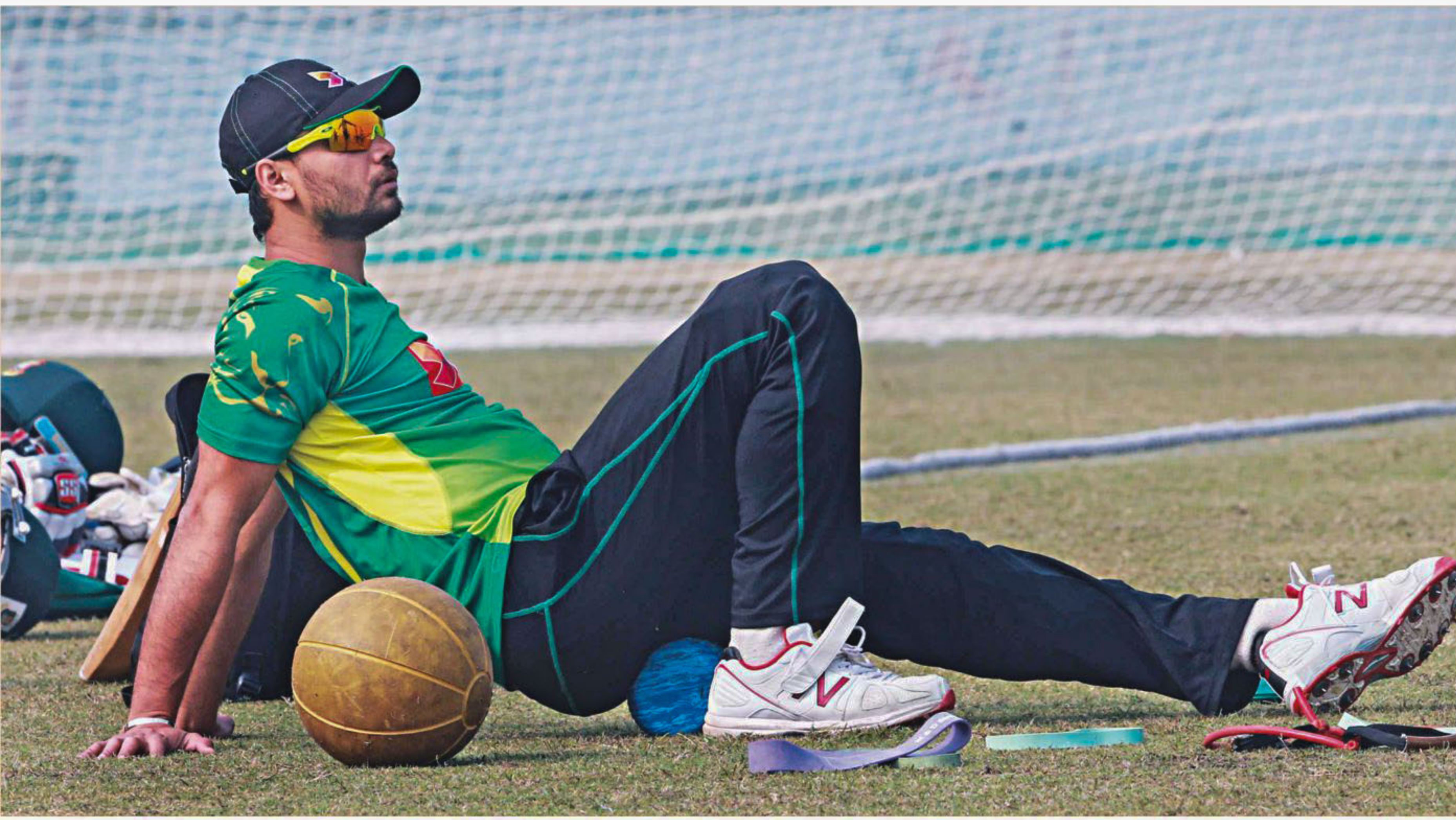
LOOKING TO ANOTHER MEMORABLE YEAR: Bangladesh skipper Mashrafe Bin Mortaza scaled many heights in 2015, but the numerous T20 engagements in 2016 will provide the skipper with a fresh challenge, starting against Zimbabwe in Khulna today.