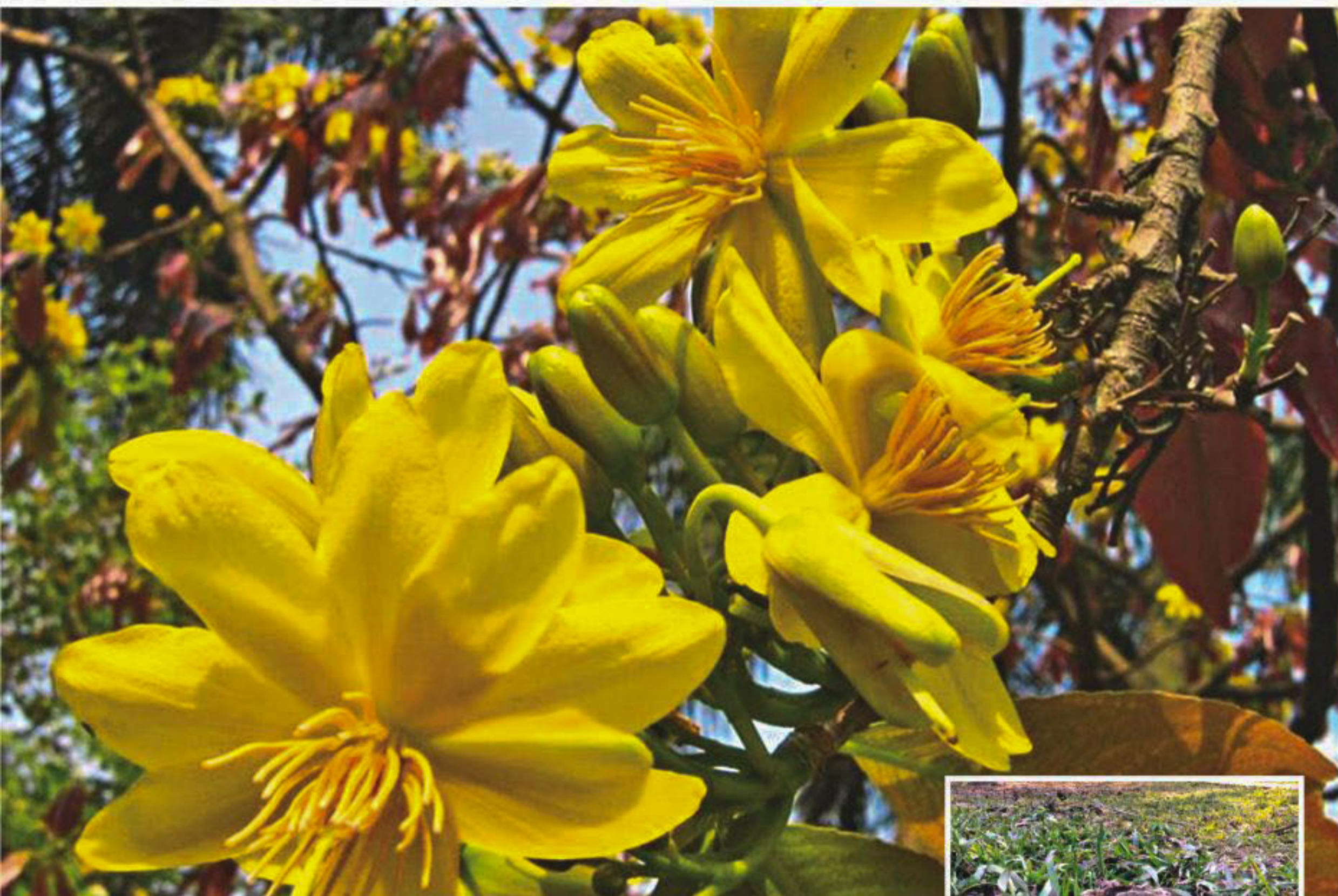
A Kanakchampa flower in full bloom. The only plant with the fragrant flower at the capital's Ramna Park has been 'mistakenly' cut down by the gardeners. Inset, the stump of the plant is all that now remains.