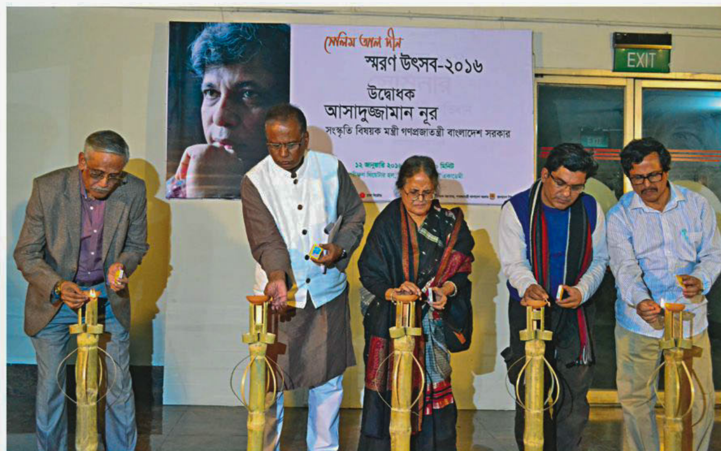
Guests light clay candles to inaugurate the ceremony.