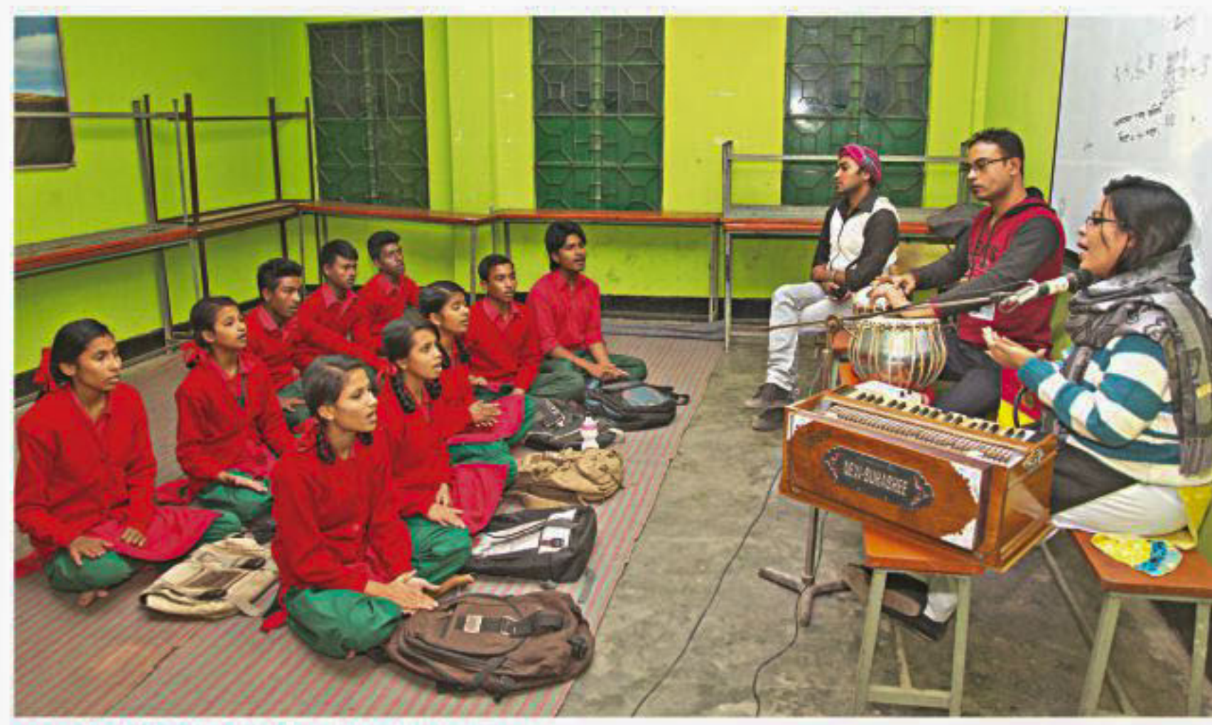
Students learn music at Surer Dhara.