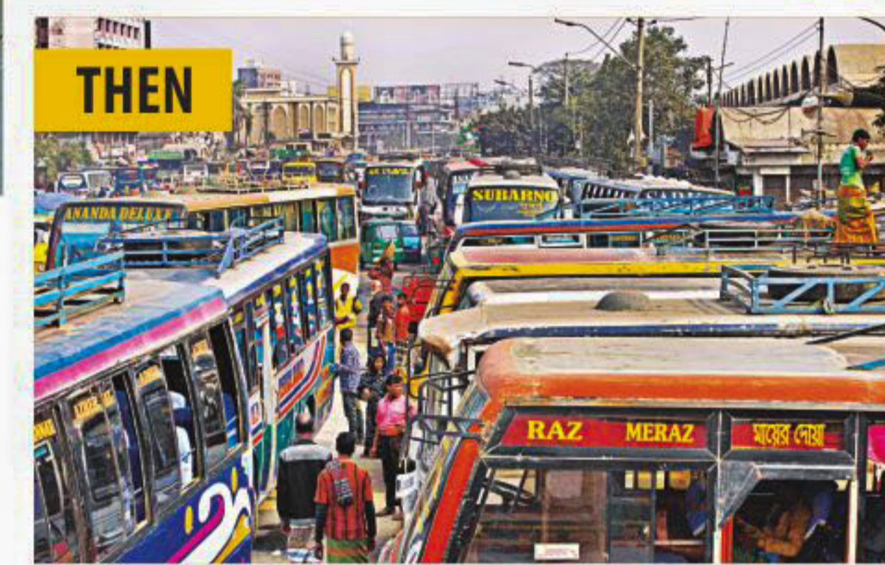
Traffic moving freely on Shyamoli-Aminbazar road in front of the capital's Gabtoli Inter-District Bus Terminal on Sunday, much to the relief of commuters. People over the years had to endure long tailbacks in the area due to illegally parked vehicles, inset. But things improved since December 29 last year when Dhaka North City Corporation prohibited parking on the road.