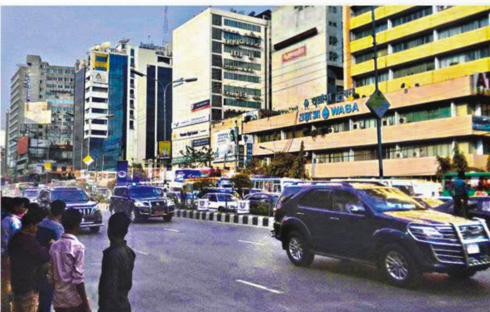
People head for their destinations on foot as the city saw an acute shortage of public transport due to massive gridlock centring an Awami League rally at Suhrawardy Udyan yesterday. Top right , a procession of Ramna Thana unit of Mahila Awami League marches towards the rally venue through Shahbagh intersection. Bottom right , bikers encroach on a footpath near the intersection adding to the suffering of pedestrians. Left , vehicles of VIPs take the wrong side of the road at Karwan Bazar to go to the rally.