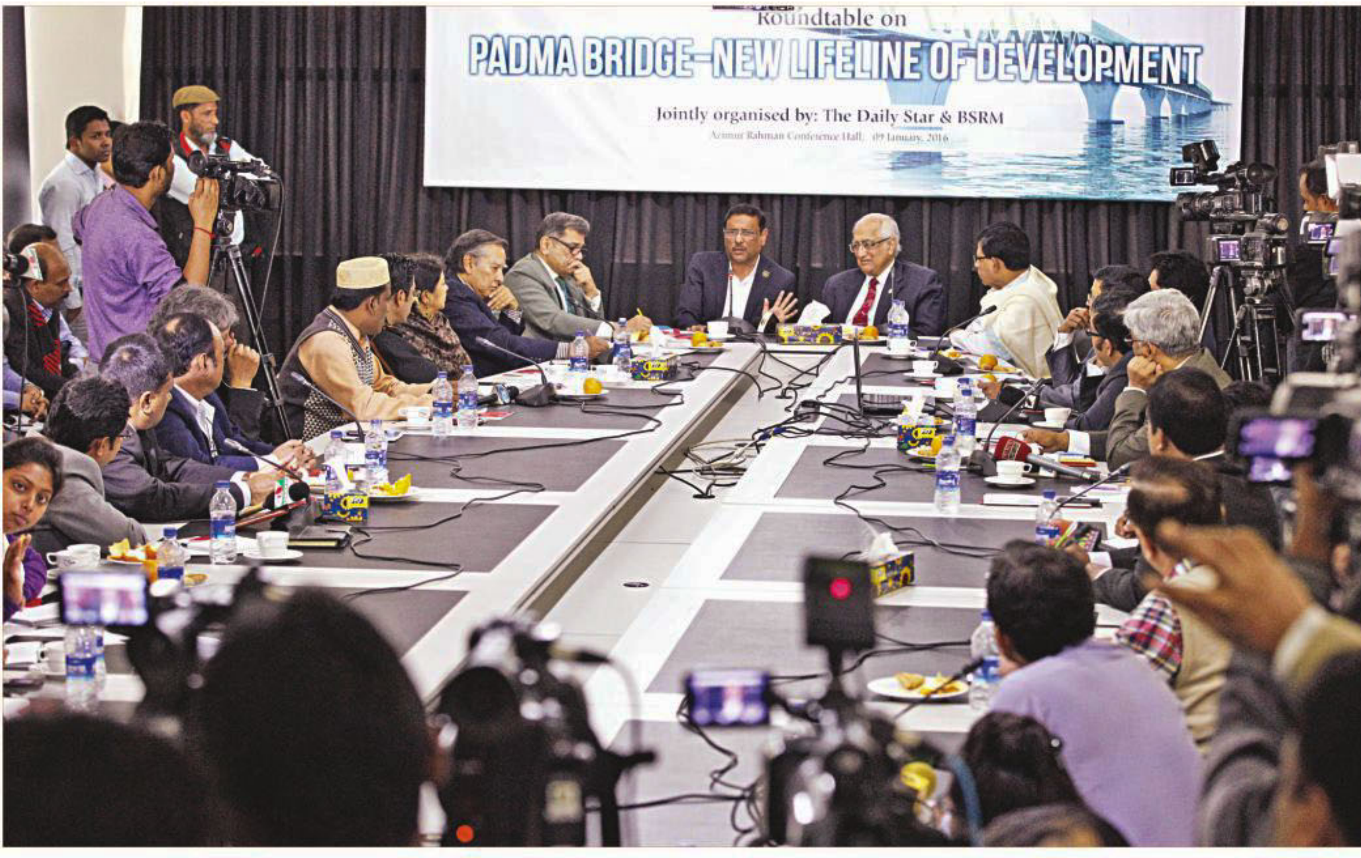
Obaidul Quader, minister for road transport and bridges, and Jamilur Reza Choudhury, chairman of the government's panel of experts on Padma bridge, attend a roundtable on the project, at The Daily Star Centre yesterday.

Last week, the Executive Committee of the National Economic Council, chaired by Prime Minister Sheikh Hasina, raised the cost for the project again, to Tk 28,793.38