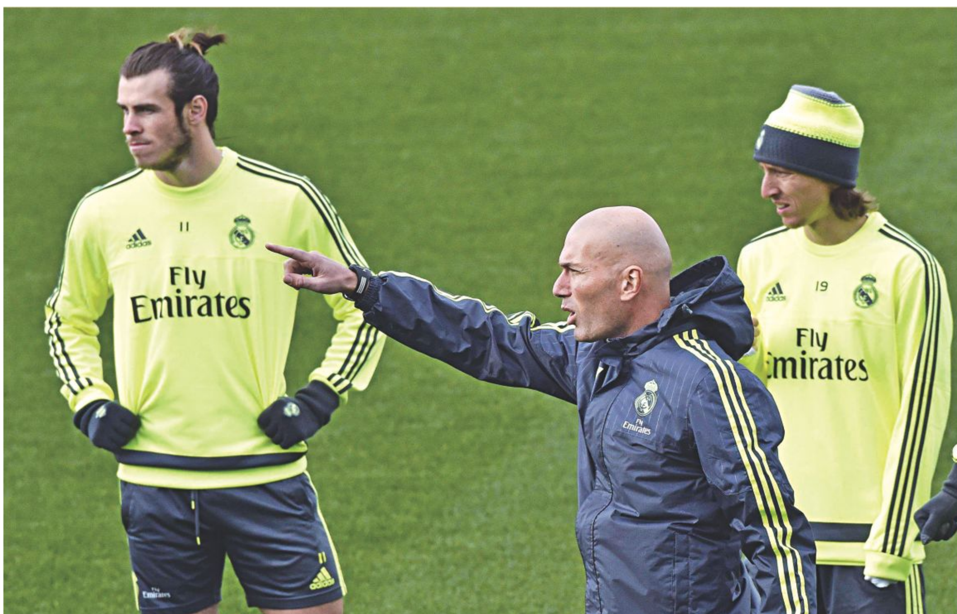
Real Madrid's new coach Zinedine Zidane (C) conducts a training session at the Valdebebas training ground yesterday. Zidane will take charge of Real Madrid for the first time today.

Villarreal v Sporting Gijon (1100), Real Sociedad v Valencia (1500), Eibar v Espanyol, Las Palmas v Malaga (1715), Celta Vigo v Atletico Madrid (1930)