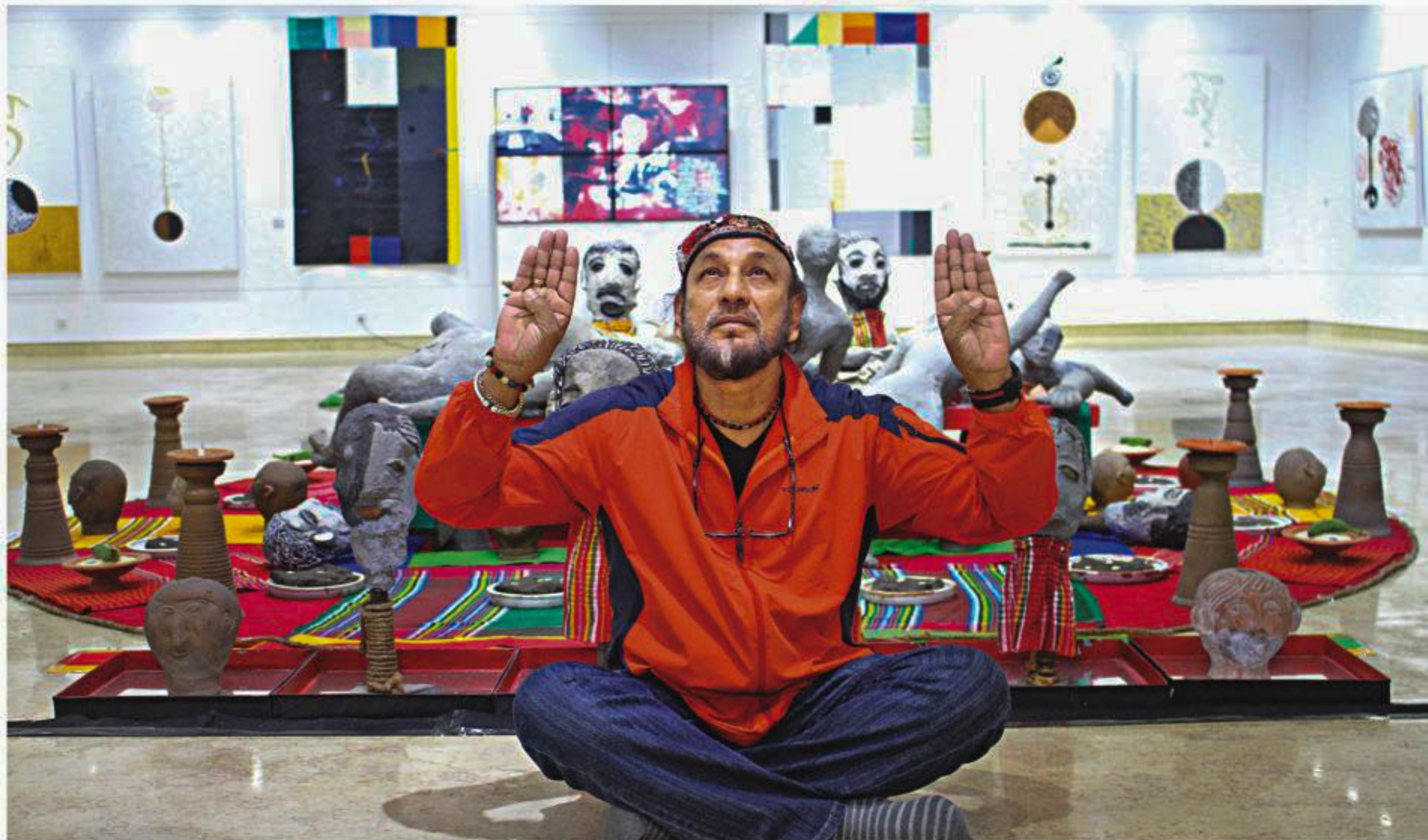
The artist portrays lyrical rhythms through his pen and ink drawings while his installations evoke the sublime memories of the martyred of 1971.

The conscience of the Liberation War is conspicuous in some of his arts and installation. The turbulent days of 1971, people's sufferings, death and destruction together with the artist's recurring subjects encapsulating the agonies and frustration of Bangladeshis in times of war and other natural and socio-political adversities in the post independent era have been articulated on large canvases.