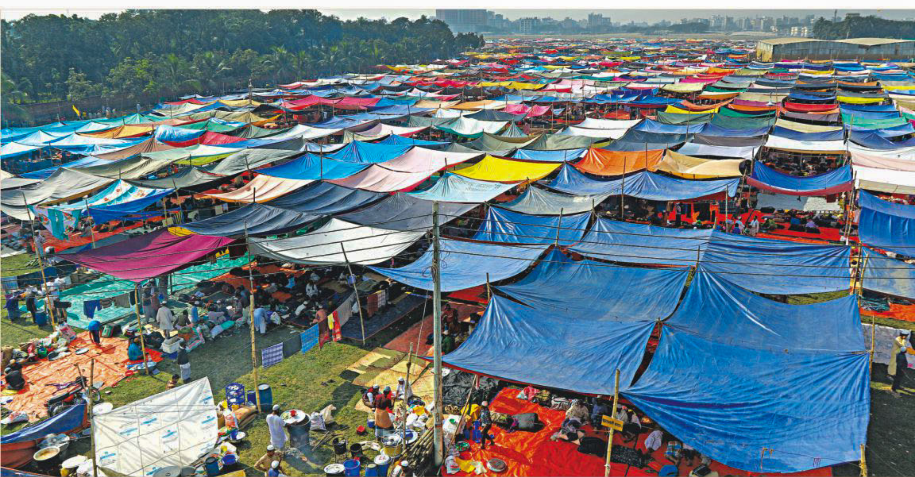
Thousands of tents pitched on the bank of Turag to house pilgrims as Biswa Ijtema, one of the biggest Muslim congregations in the world, begins here today. The photo was taken yesterday.

FOOD MINISTER KAMRUL ISLAM AT AN ANTI-HARTAL HUMAN CHAIN PROGRAMME IN FRONT OF THE JATIYA PRESS CLUB