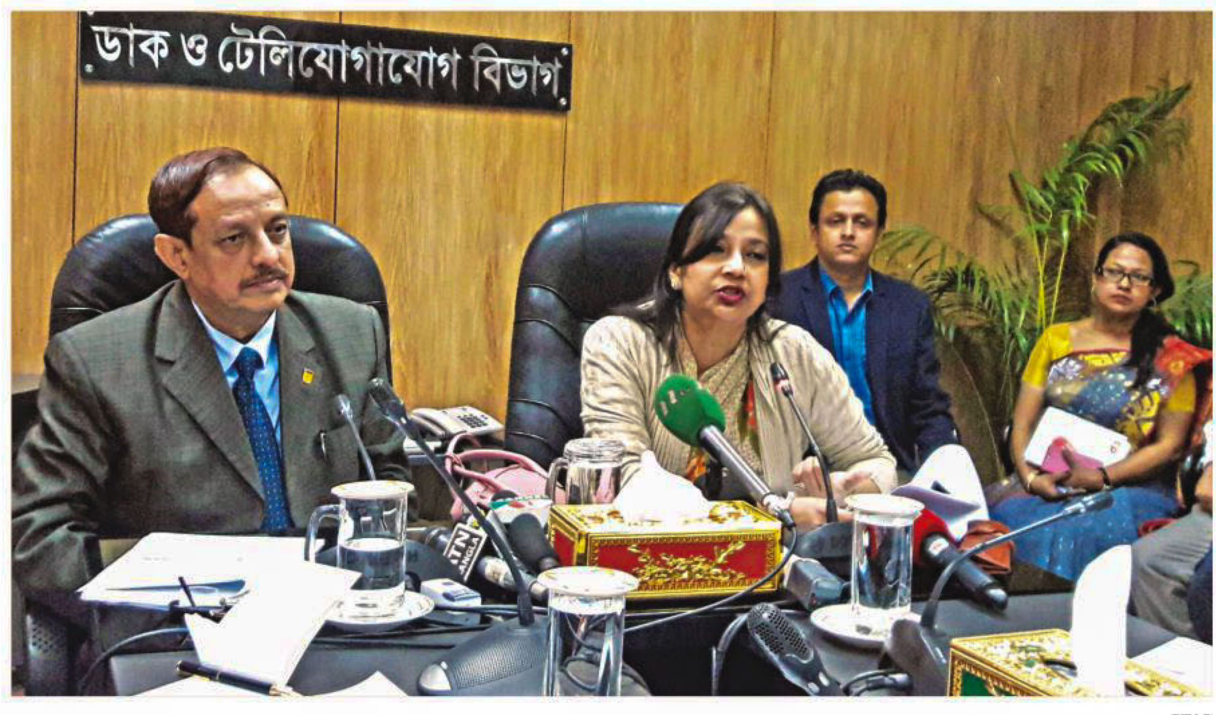
Tarana Halim, state minister for telecom, speaks at a press conference in her office in Dhaka yesterday.

STAR BUSINESS REPORT The cabinet committee on purchase yesterday approved a proposal to import 25,000 tonnes of urea. The government will buy fertiliser at $273.32 a tonne. The committee also approved a proposal for the construction of eight 16-storey buildings in Uttara at a cost of Tk 341 crore. The buildings will have 672 flats with 1,250 square feet each. The committee also approved a proposal for the appointment of a consultant for building eight steel silos. The silos will be built under the Modern Food Storage Facility project with financial assistance from the World Bank. Different crops, including rice and wheat, are damaged by floods and other natural disasters every year. The WB in 2013 approved a $210 million fund for building modern silos in different areas of Bangladesh.