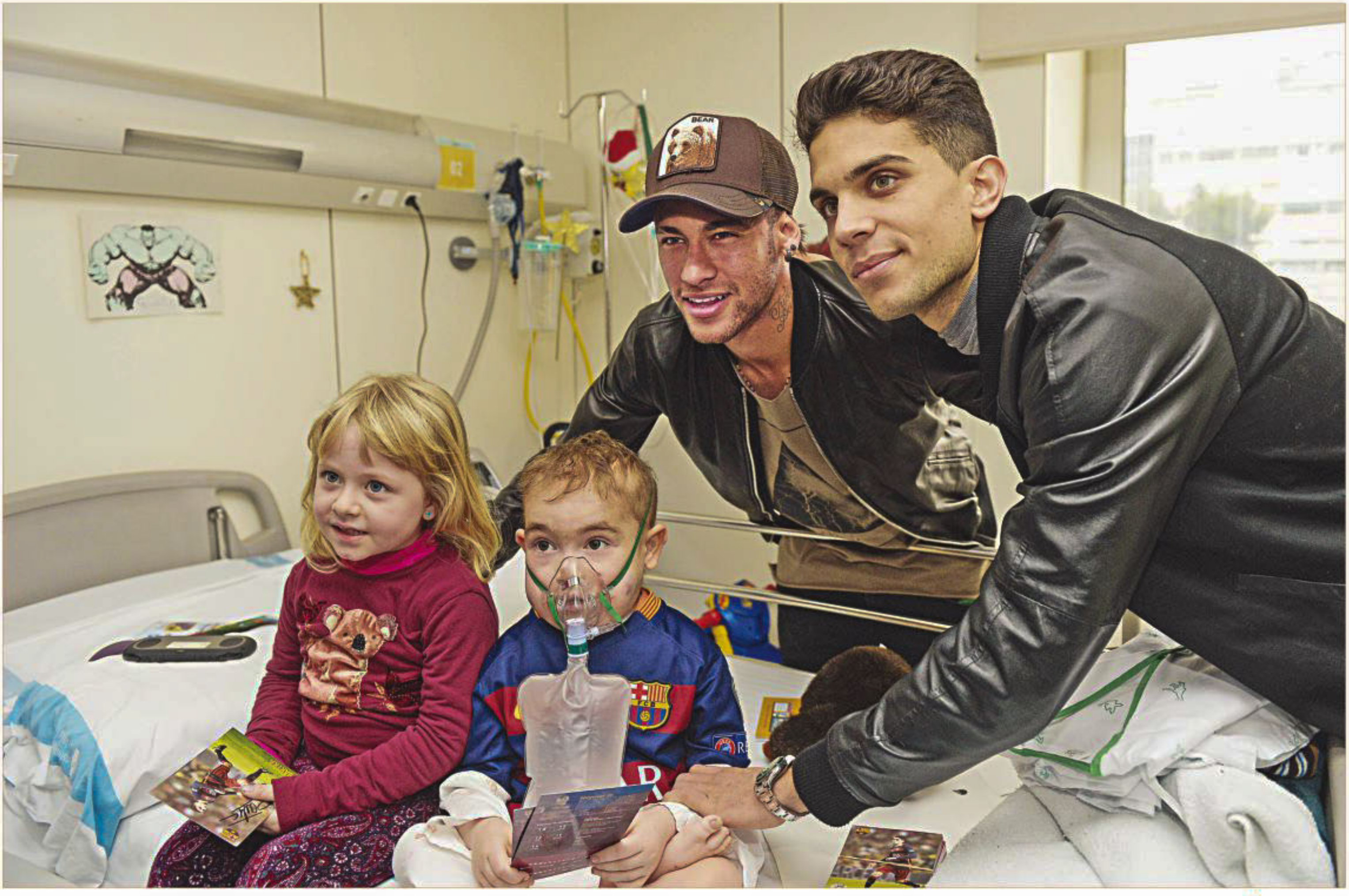
Barcelona star Neymar and defender Marc Bartra (R) make a charity visit and put smiles on the children's faces at the Hospital of Vall d'Hebron in Barcelona yesterday.

AGENCIES, Barcelona Barcelona's Luis Enrique has been named the World's Best Club Coach of 2015 by the International Federation of Football History and Statistics (IFFHS). The 44-year-old won the award by a considerable margin with 165 points, almost twice as many as outgoing Bayern Munich boss Pep Guardiola, who only mustered 86. Enrique succeeds Carlo Ancelotti, who claimed the accolade in 2014 for guiding Real Madrid to a historic 10th Champions League title. He also becomes the second Barca coach to be crowned the best in the world after Guardiola in 2009 and 2011 and Frank Rijkaard in 2006.