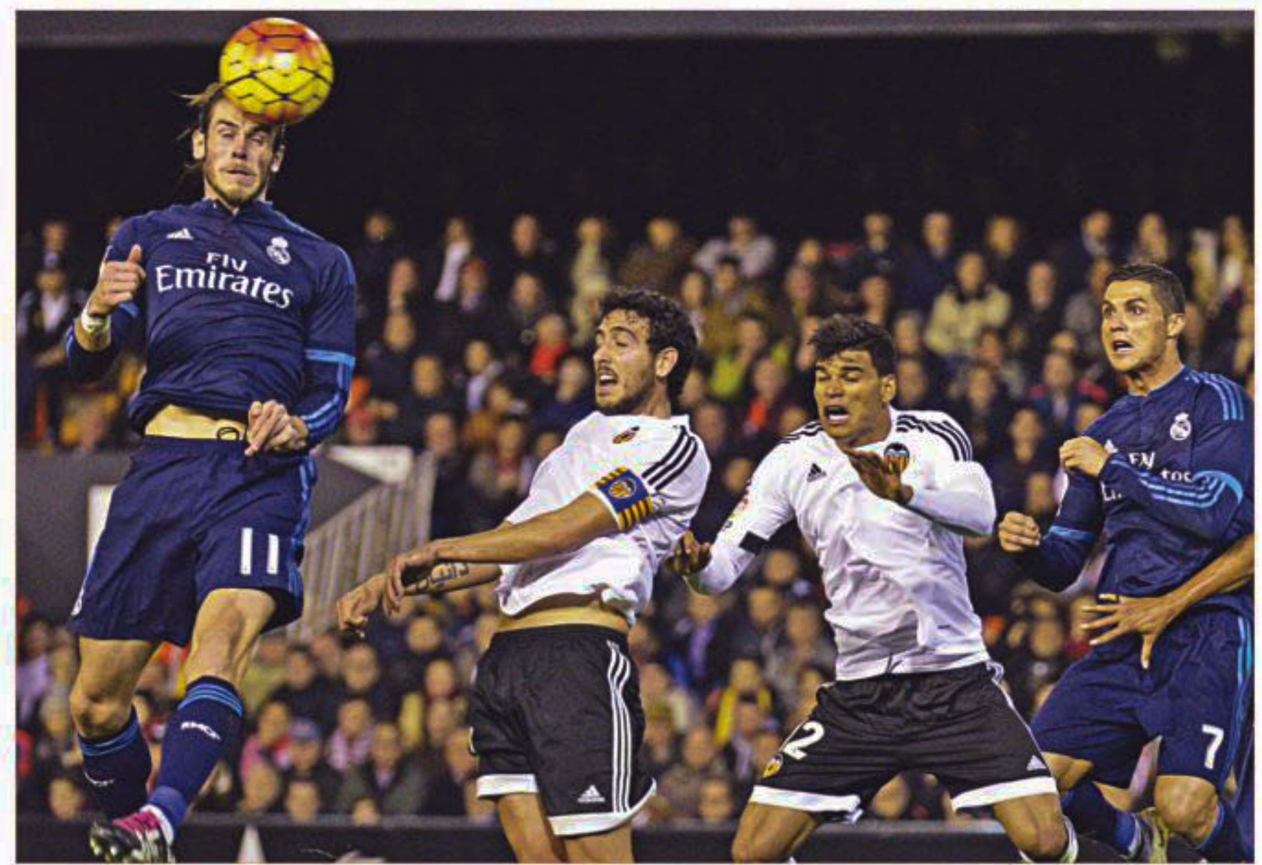
Real Madrid winger Gareth Bale (L) heads in the second goal against Valencia during their Primera Liga match at the Mestalla on Sunday.

AFP, Madrid Beleaguered Real Madrid coach Rafael Benitez could be sacked by the Spanish giants as early as Monday evening after just seven months in charge, several Spanish media outlets reported. Sports daily Marca reported Benitez's sacking will be made official in the coming hours with French legend and the club's reserve team coach Zinedine Zidane to take over. Madrid twice threw away the lead in drawing 2-2 away to Valencia on Sunday to leave Benitez's men four points adrift of local rivals Atletico Madrid at the top of La Liga. They also trail eternal rivals Barcelona by two points having played a game more. The appointment of the former Liverpool and Chelsea manager in June