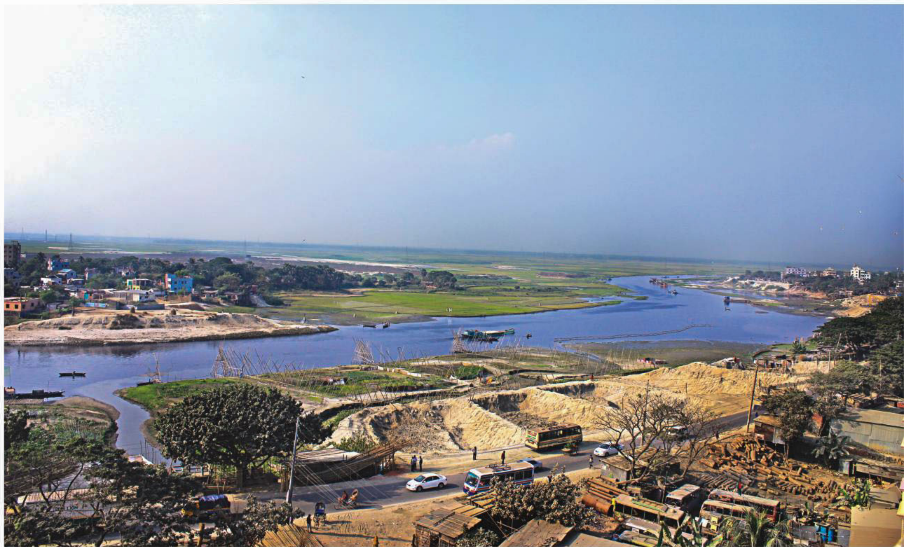
Despite repeated drives, sand traders still occupy a large portion of the Turag river foreshore at Sinnirtek in the capital's Mirpur. Such illegal activities are usually aimed at paving the way for permanent land grabbing. The BIWTA, Dhaka district administration, local police, and the Department of Environment, among others, are tasked with stopping such encroachment but they visibly have failed. The photo was taken yesterday.