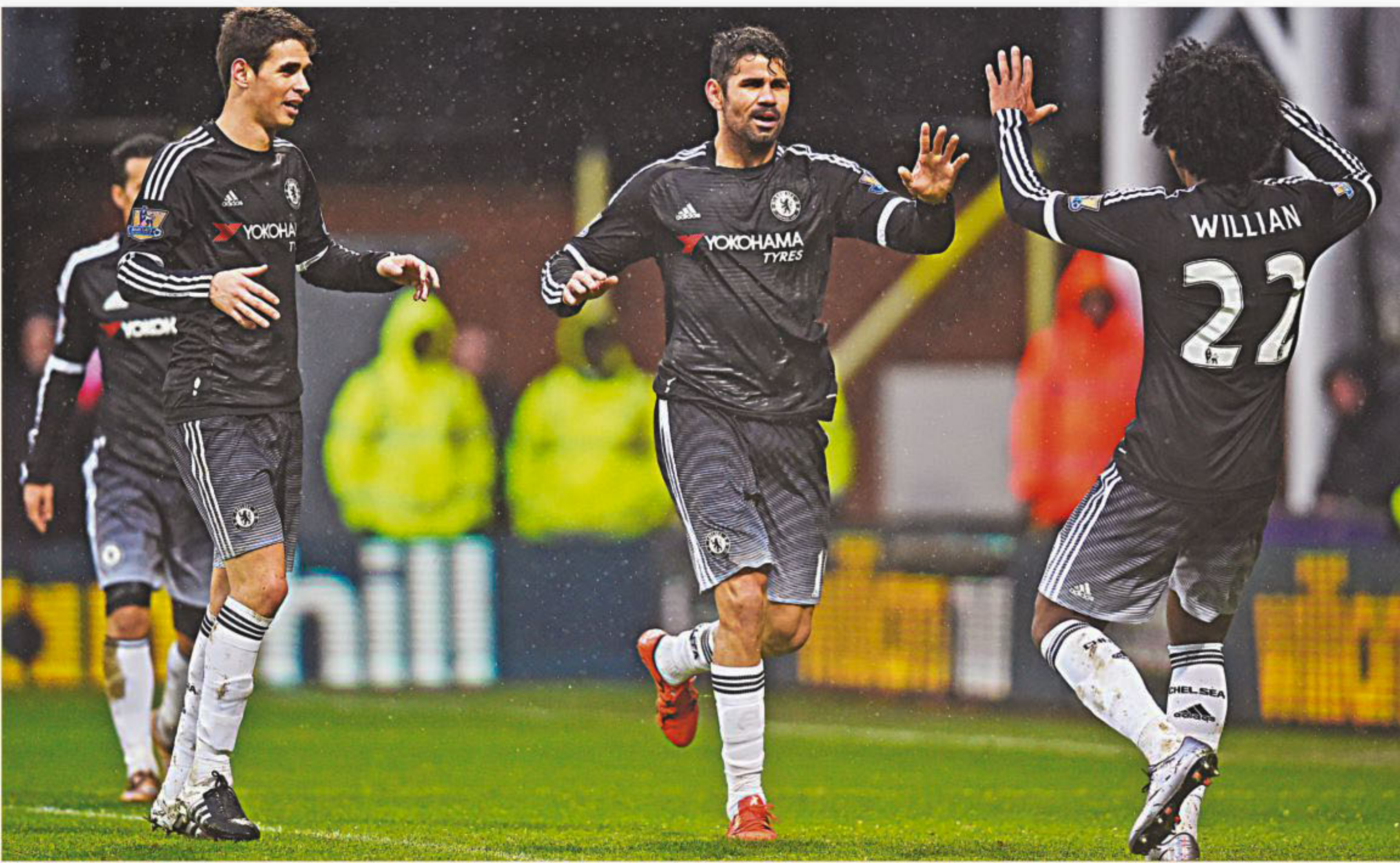
Chelsea's three goal-scorers (From L) Oscar, Diego Costa and Willian celebrate after Costa scored the third goal and effectively sealed his side's win against Crystal Palace at Selhurst Park yesterday.