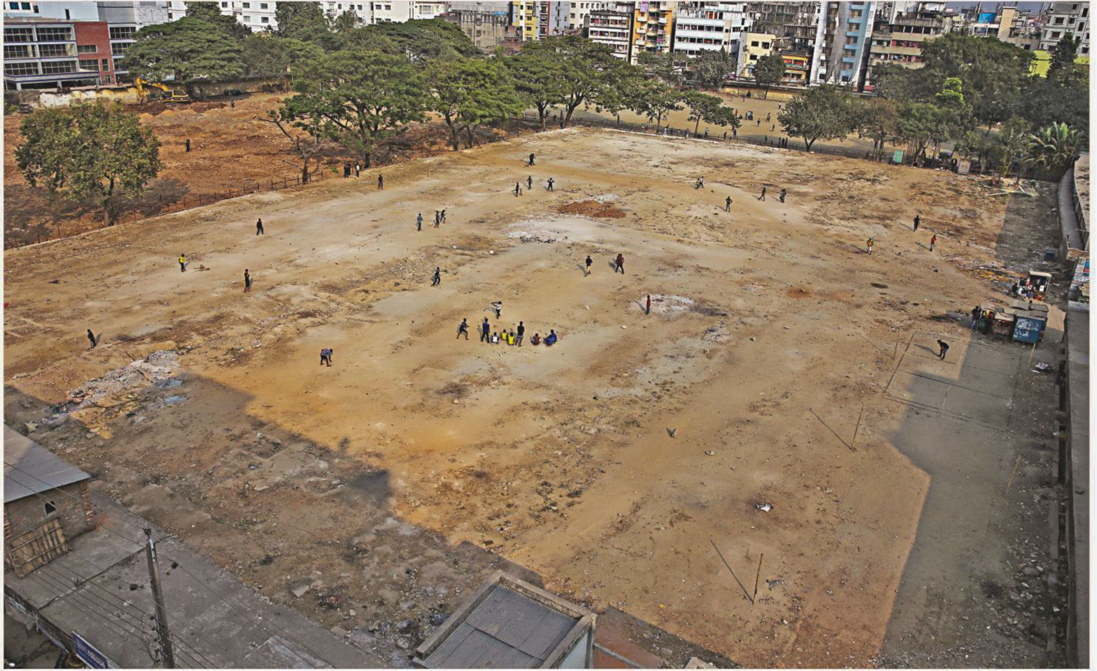
The part of the enormous Dhupkhola Math, which is open to all, has not been repaired by Dhaka South City Corporation (DSCC) after its surface was badly damaged for storing construction materials of Mayor Mohammad Hanif Flyover. However, defying risks of injury in the field riddled with craters and littered with masonry, children have started coming to play there. The photo was taken yesterday.