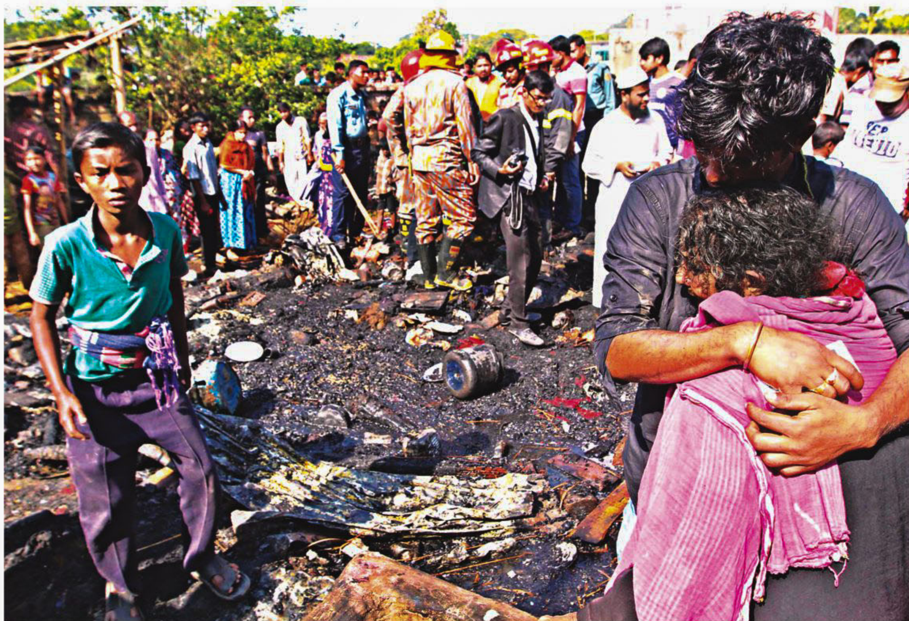
A man trying to console an elderly woman amid the ashes of her home, which along with two other houses on Railway Station Road Colony in Chittagong city was burnt down in a fire from an electric short-circuit yesterday.

The money was kept at the office to finance subversive activities ahead of SEE PAGE 10 COL 2