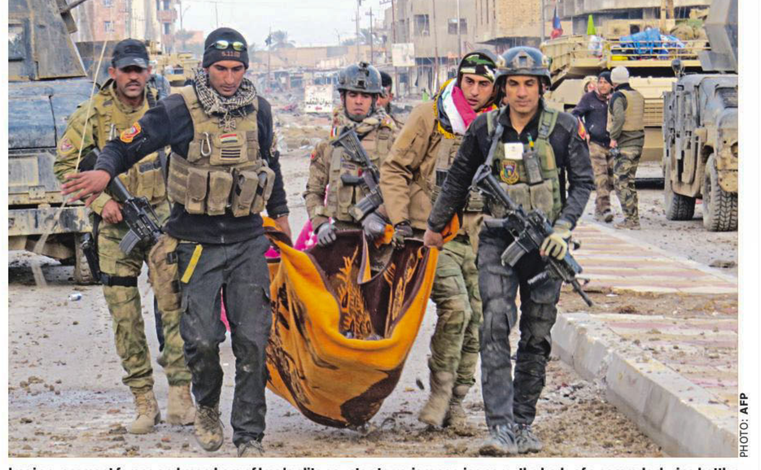
Iraqi government forces and members of Iraq's elite counter-terrorism service carry the body of a comrade during battles with Islamic State (IS) group jihadists as they try to secure all the neighbourhoods of Ramadi, the capital of Iraq's Anbar province, yesterday. Iraq declared the city of Ramadi liberated from the Islamic State group on December 28.