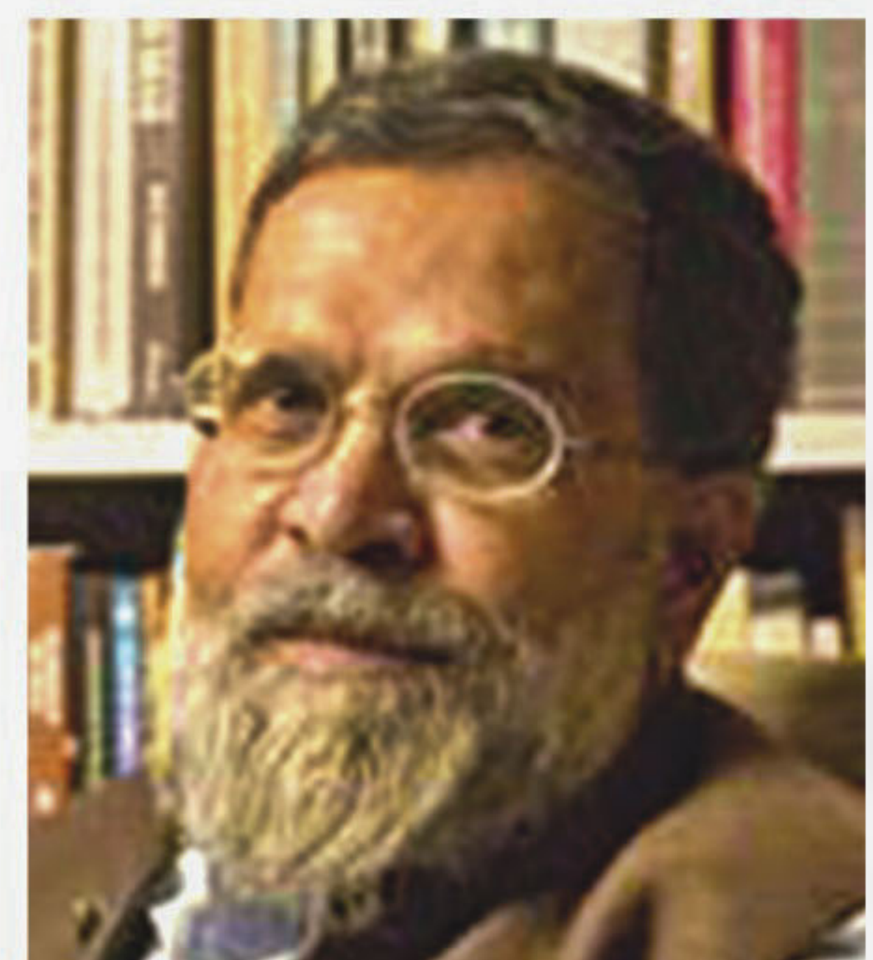
Praful Bidwai (1949 - June 23, 2015) The renowned Indian journalist and activist was also a peace veteran and won the Sean McBride International Peace Prize in 2000 in recognition of his work opposing nuclear weapons development in South Asia.