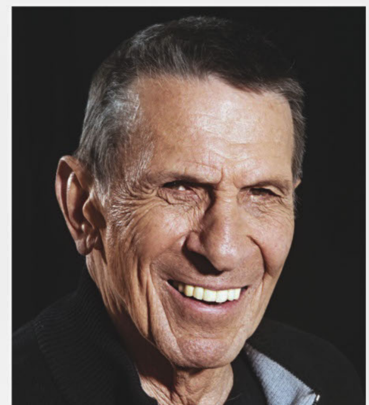
Leonard Nimoy (Mar 26, 1931 – Feb 27, 2015) The well-known actor reached cult status for his memorable portrayal of the original Mr. Spock on the TV show, Star Trek.