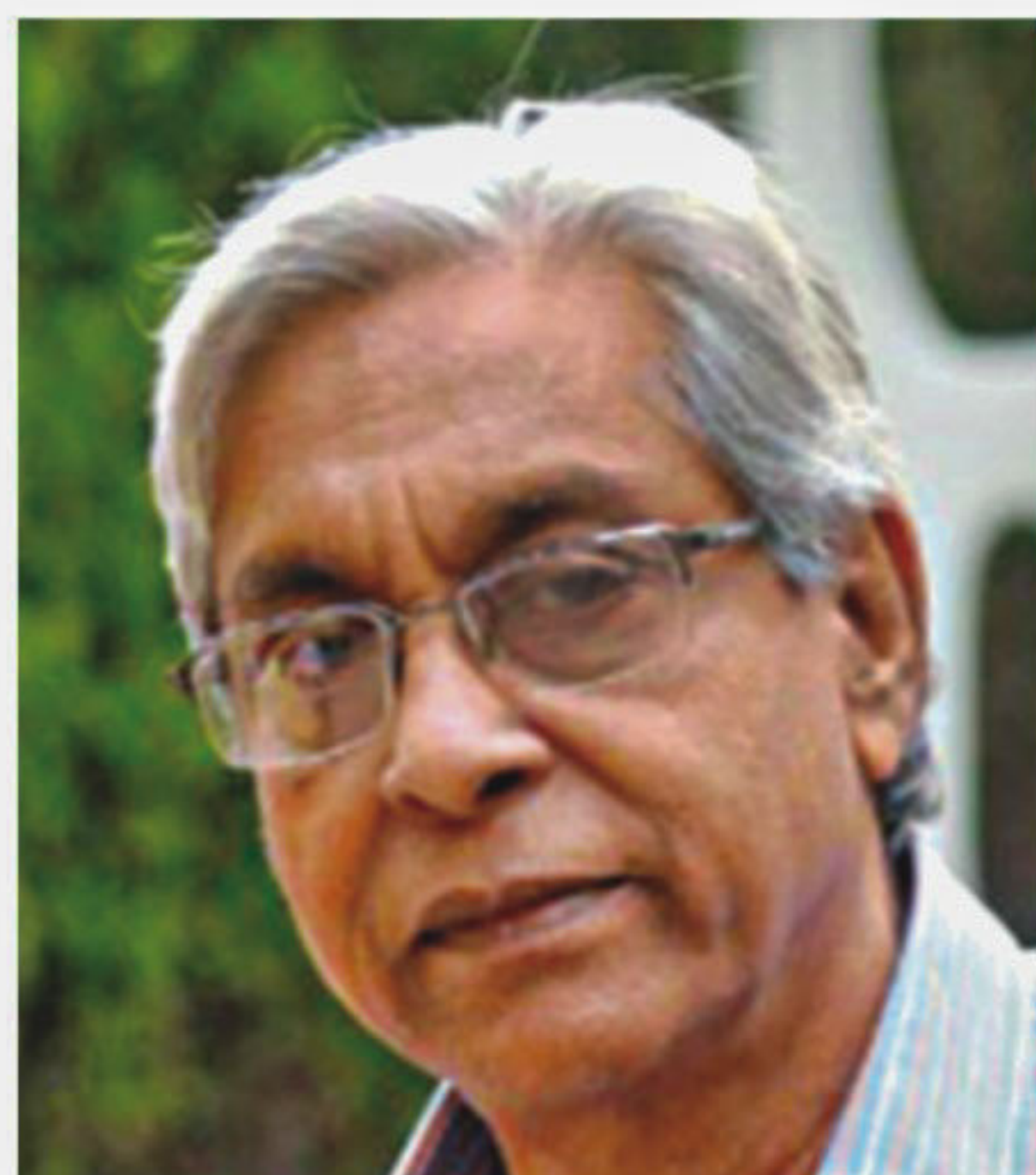
Chashi Nazrul Islam (Oct 23, 1941 – Jan 11, 2015) The renowned director was best known for his iconic film Ora Egaro Jon, one of the first films on the Liberation War.