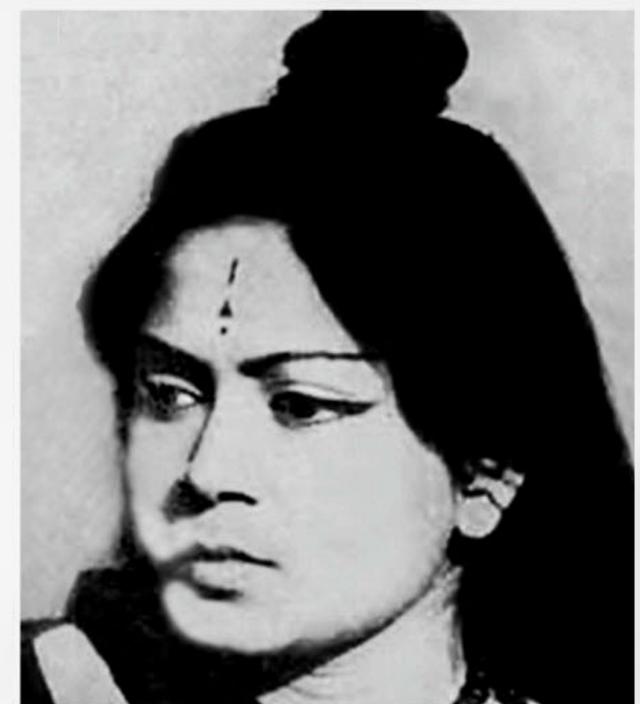
Novera Ahmed (1930 – May 6, 2015) Credited as the first modernist sculptor of Bangladesh, the renowned artist was one of the designers of the original Central Shaheed Minar.