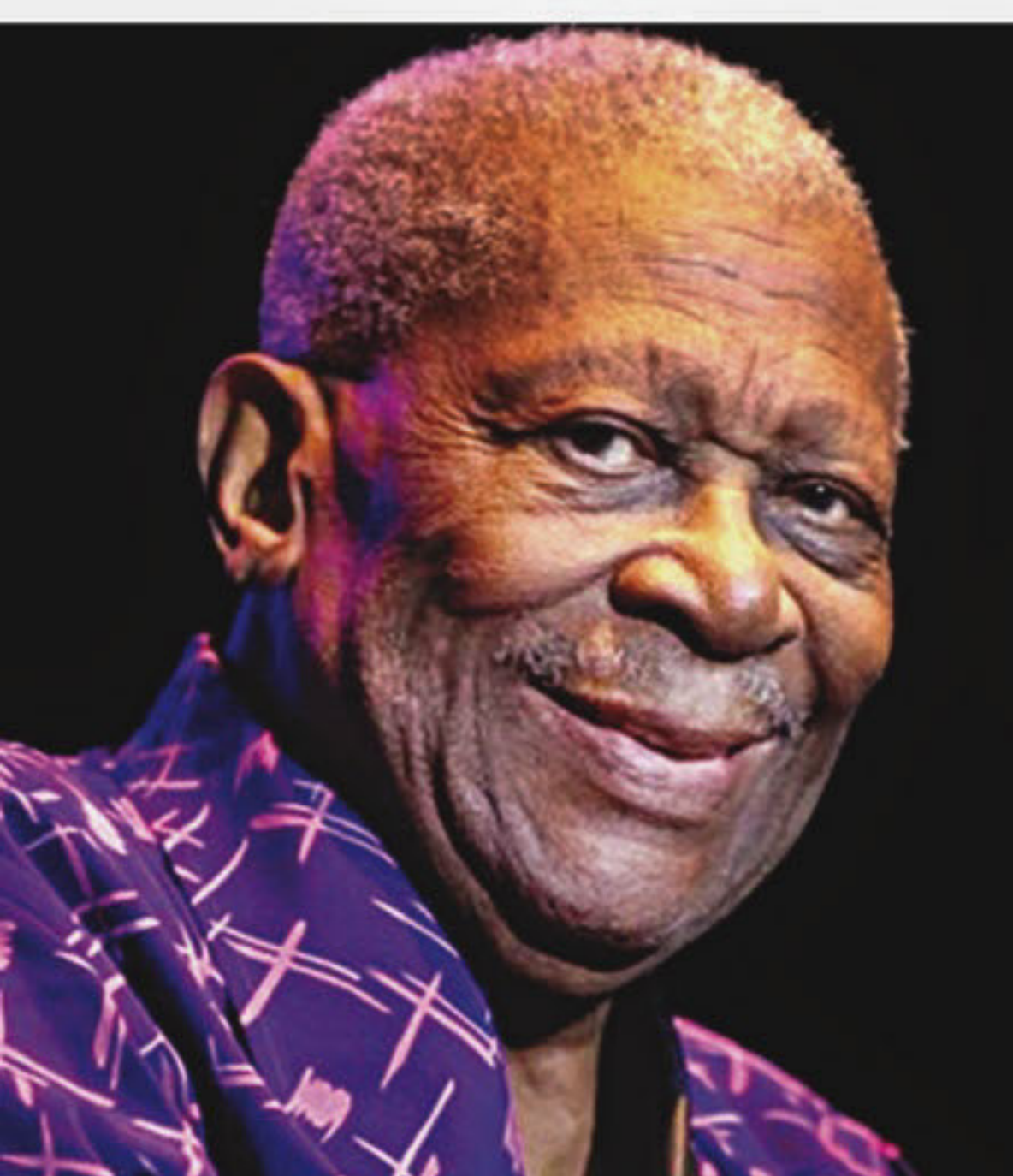
B.B. King (Sep 16, 1925 – May 14, 2015) The King of the Blues won the Grammy award 15 times and is considered to be one of the greatest guitarists of all time.