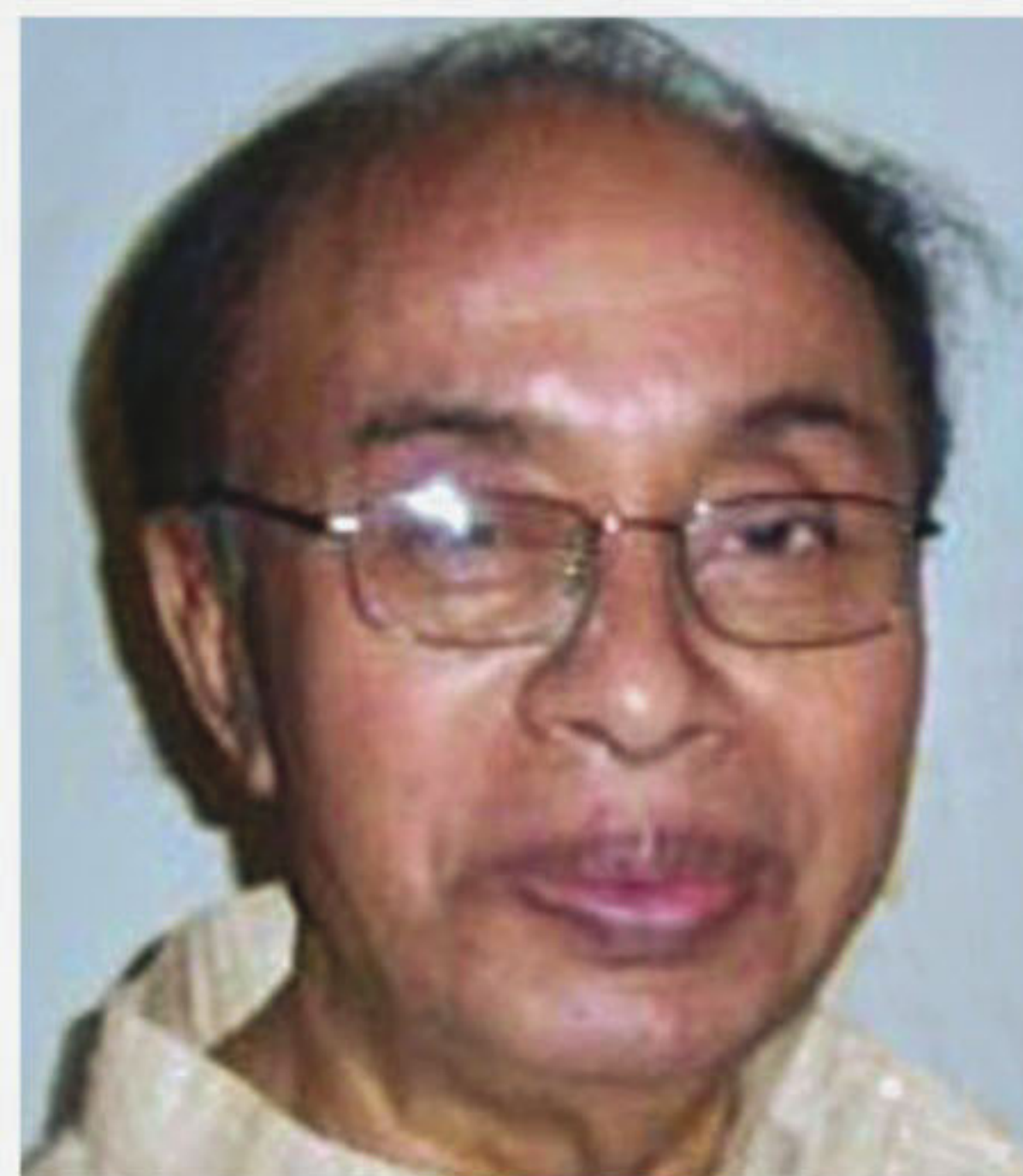
KM Shehab Uddin (1937- Apr 15, 2015) The former ambassador was one of the first diplomats to bravely disengage from the Pakistan government and declared allegiance to the Mujibnagar government in 1971.