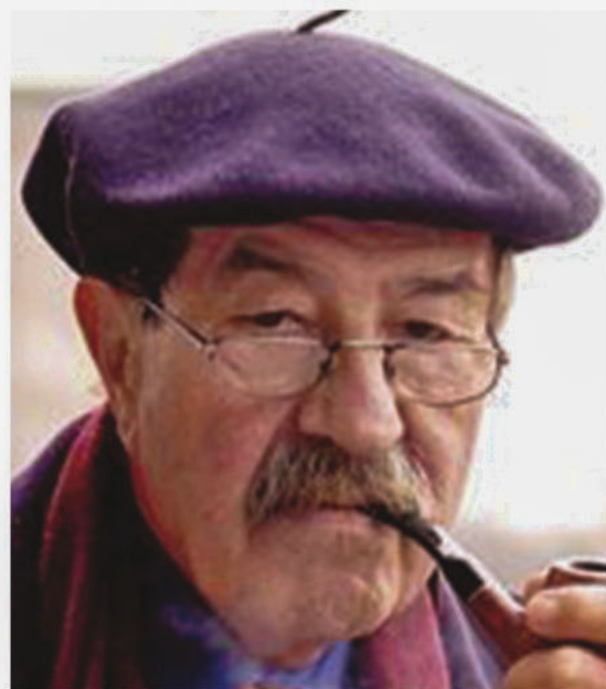
Günter Grass (Oct 16, 1927 – Apr 13, 2015) The Nobel-winning German writer was most famous for his novel The Tin Drum, which sold millions of copies and was adapted into an Academy Award winning movie.