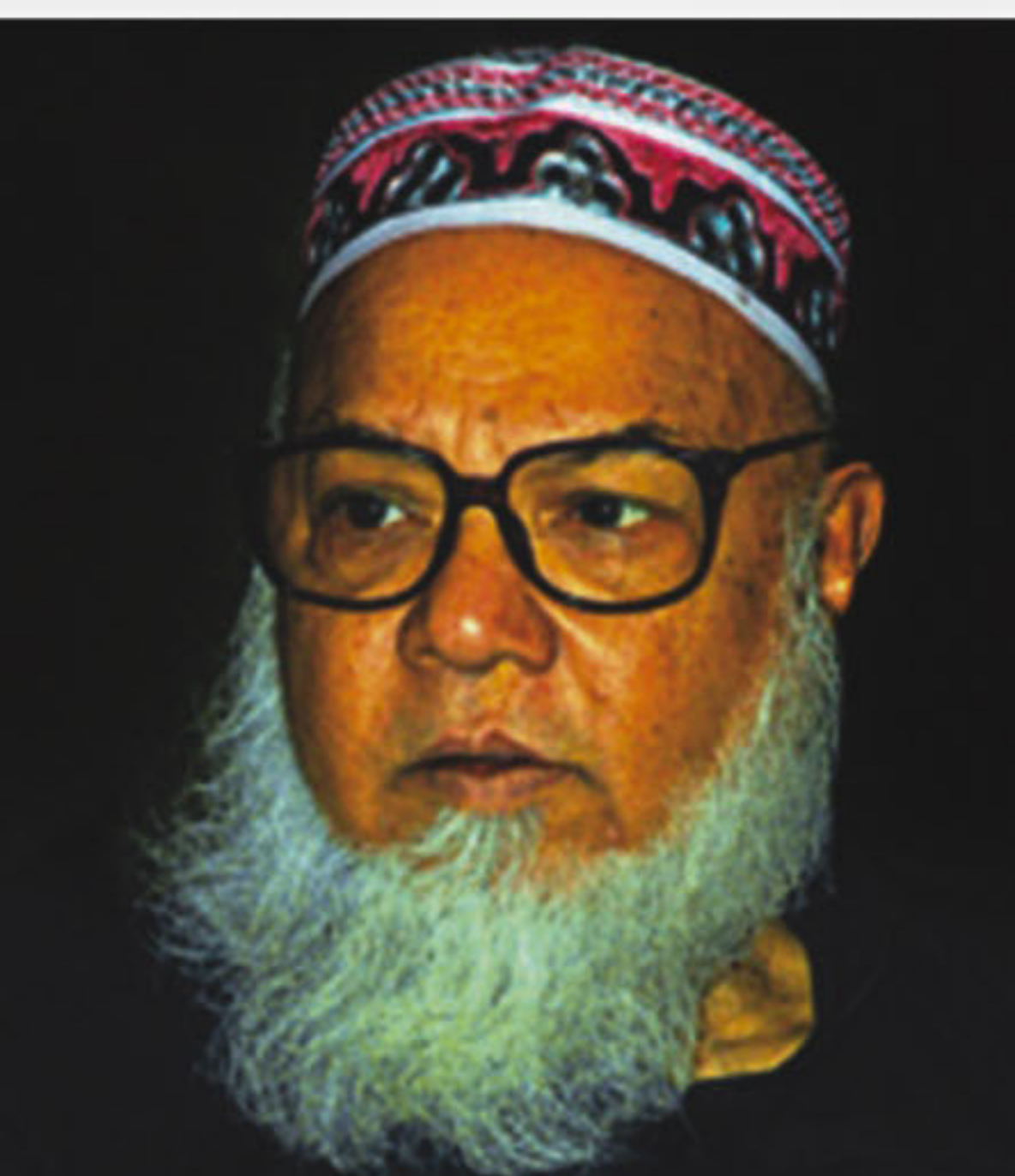
Mustafa Kamal (1933 - Jan 5, 2015) The eminent jurist and former chief justice is often credited as the father of Alternative Dispute Resolution (ADR) in Bangladesh.