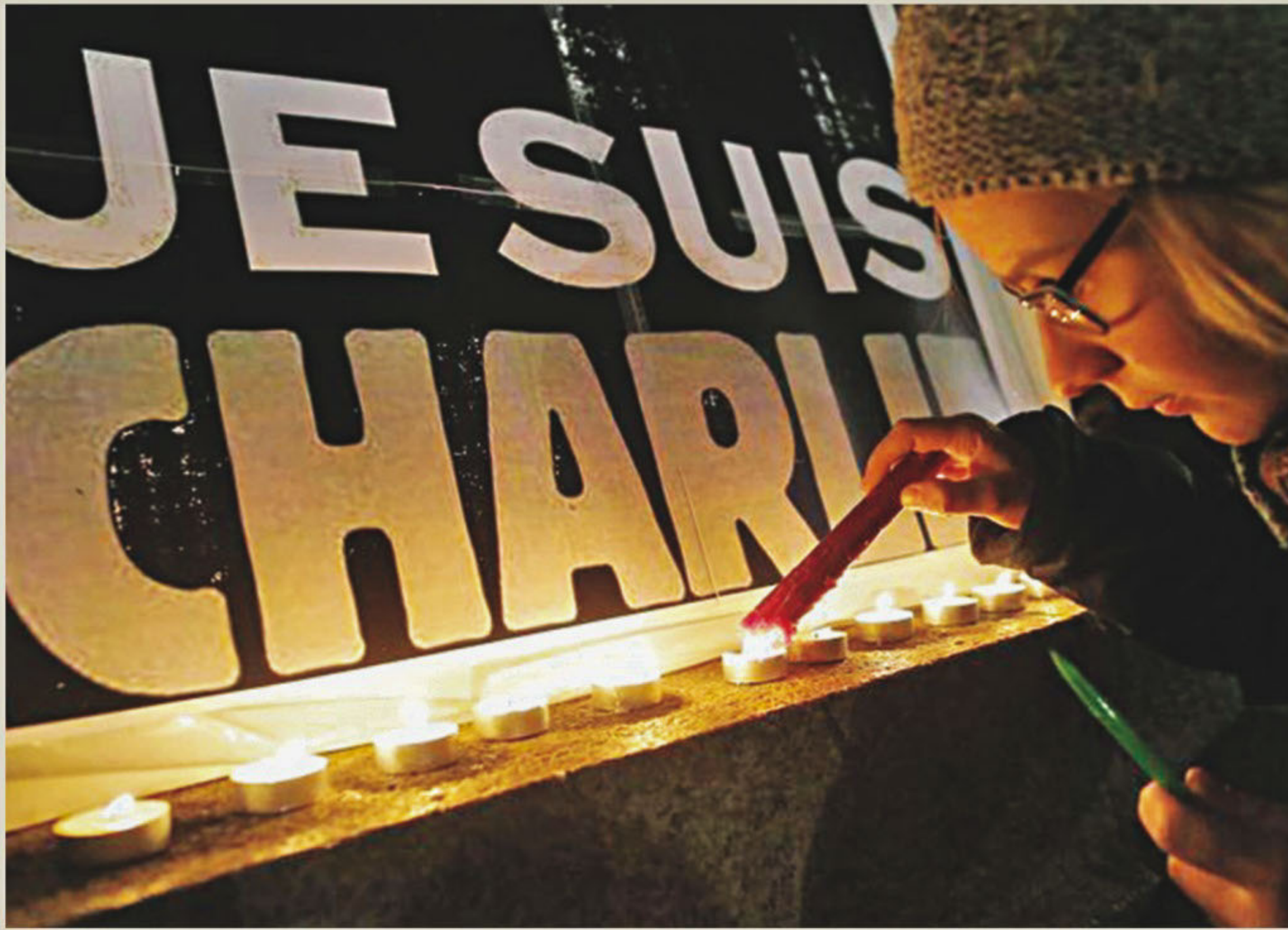
CHARLIE HEBDO ATTACK (JANUARY 7, 2015)