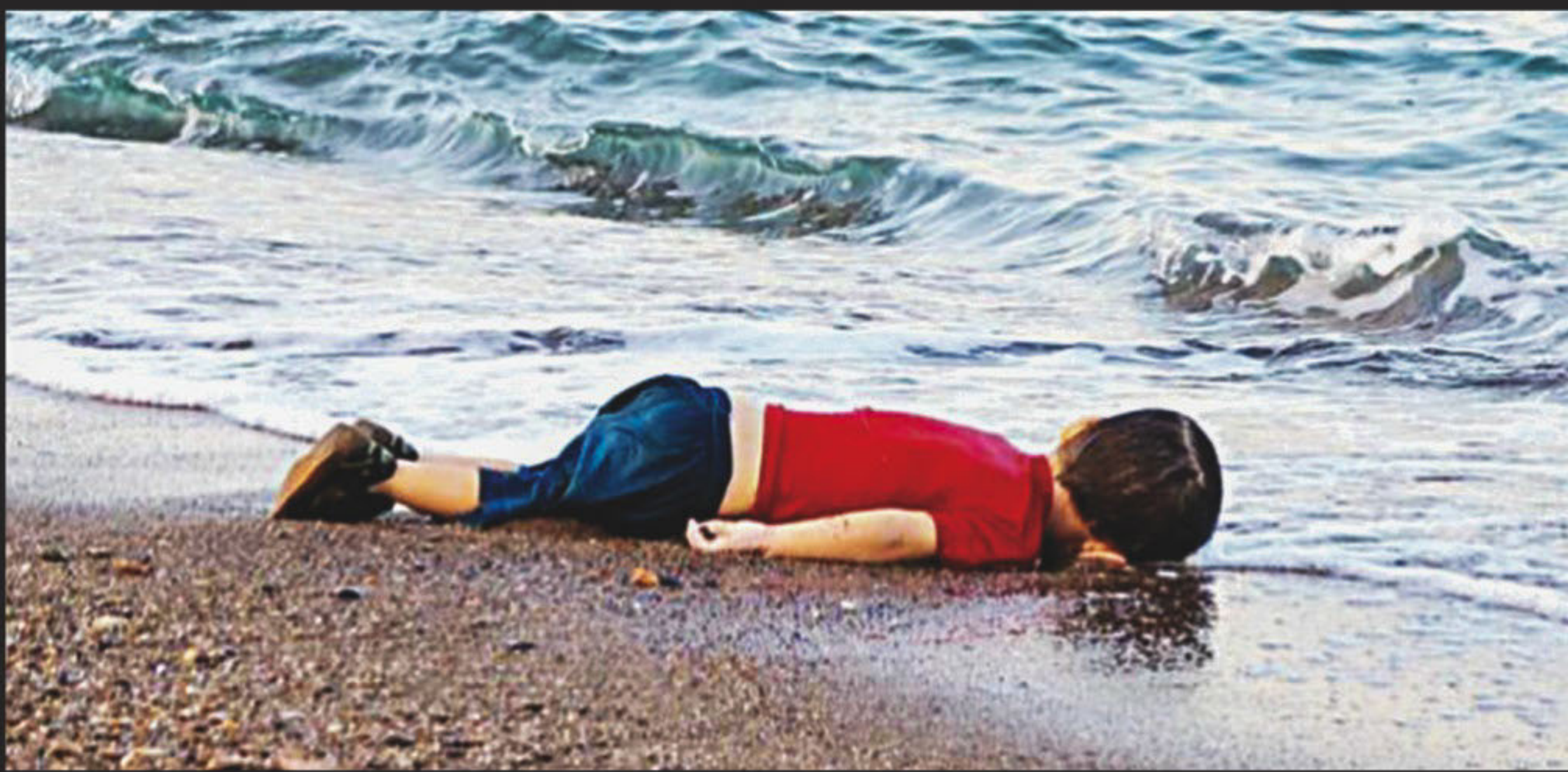
MIGRATION CRISIS IN EUROPE

The image of Syrian toddler Aylan Kurdi made global headlines after his dead body washed up on the shore of a beach in Turkey. Vast numbers of migrants from war-torn Middle Eastern regions have made their way across the Mediterranean to Europe in 2015, sparking a crisis as countries struggle to cope with the influx, and creating division in the EU over how best to deal with resettling people.