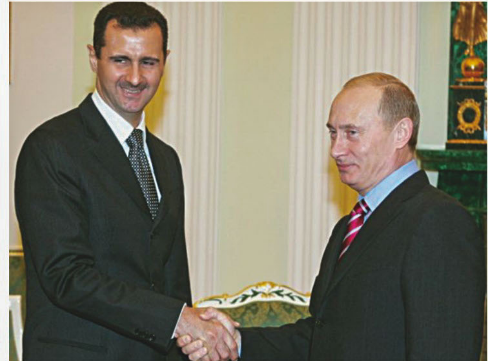
RUSSIA INTERVENES SYRIAN CIVIL WAR (SEPTEMBER 30, 2015)

The image of Syrian toddler Aylan Kurdi made global headlines after his dead body washed up on the shore of a beach in Turkey. Vast numbers of migrants from war-torn Middle Eastern regions have made their way across the Mediterranean to Europe in 2015, sparking a crisis as countries struggle to cope with the influx, and creating division in the EU over how best to deal with resettling people.