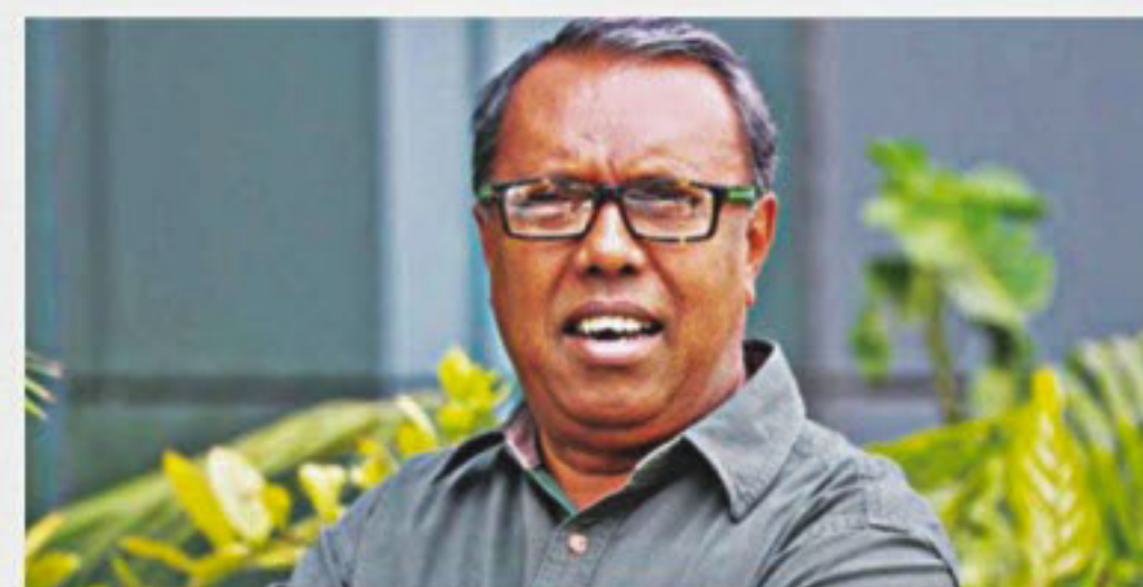
Development journalist Shykh Seraj won the Gusi Peace Prize 2015 for his "exceptional" media activism over the past three decades in reducing poverty in Bangladesh. (November 25, 2015)