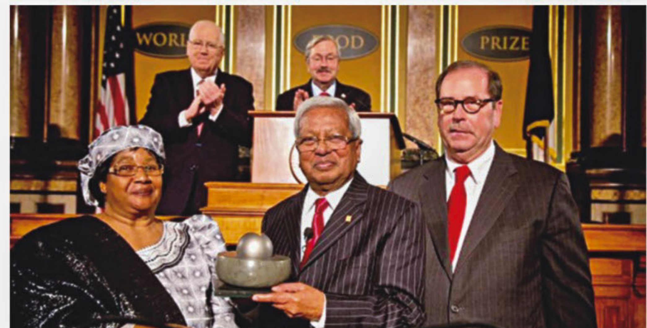
BRAC founder and chairperson Sir Fazle Hasan Abed was honoured as the 2015 World Food Prize Laureate for his outstanding contributions to enhancing the world's production and distribution of food to those most in need. (October 16, 2015)