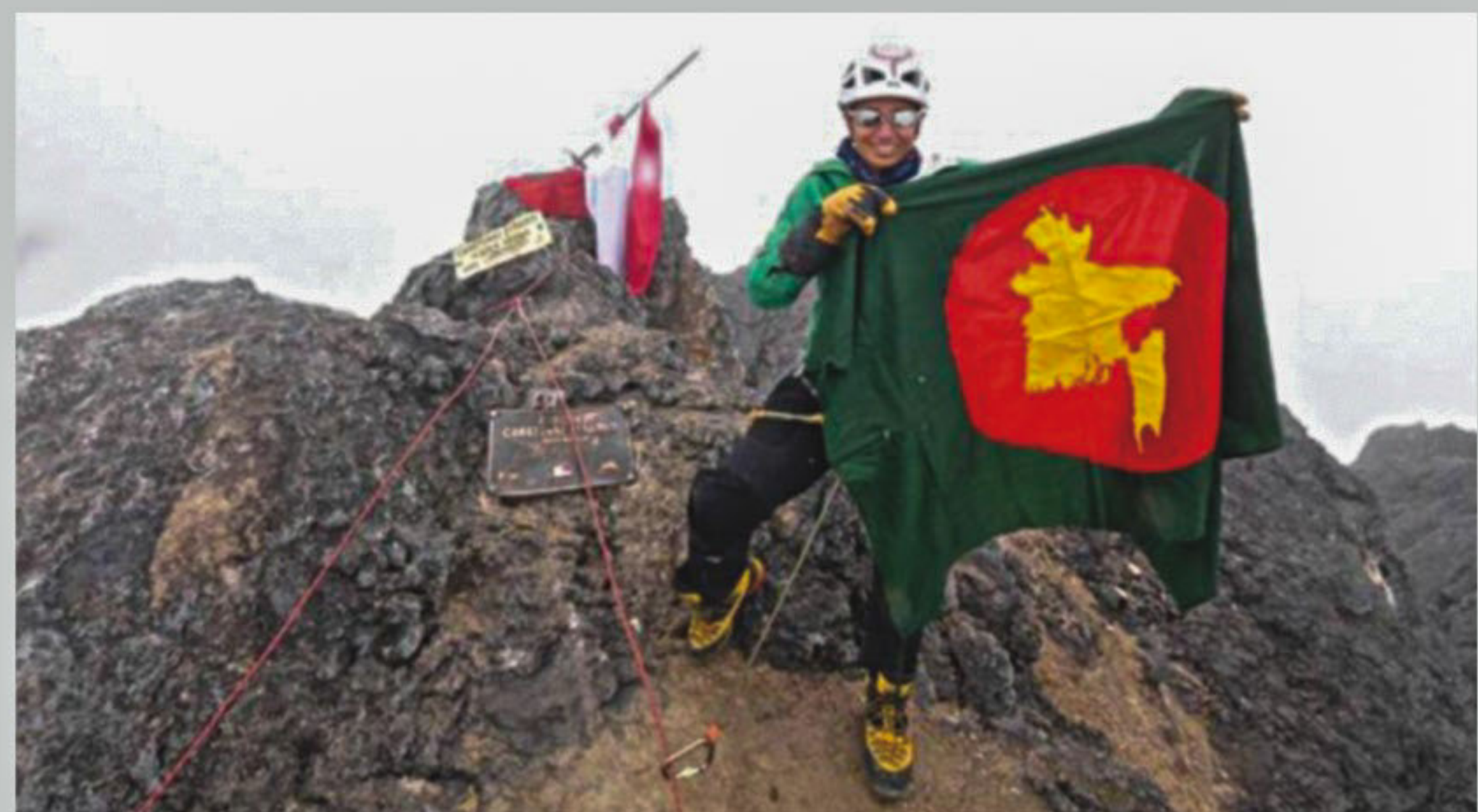
Wasfia Nazreen became the first Bangladeshi to scale the mountain peaks of all the seven continents, also known as the Seven Summits. (November 18, 2015)