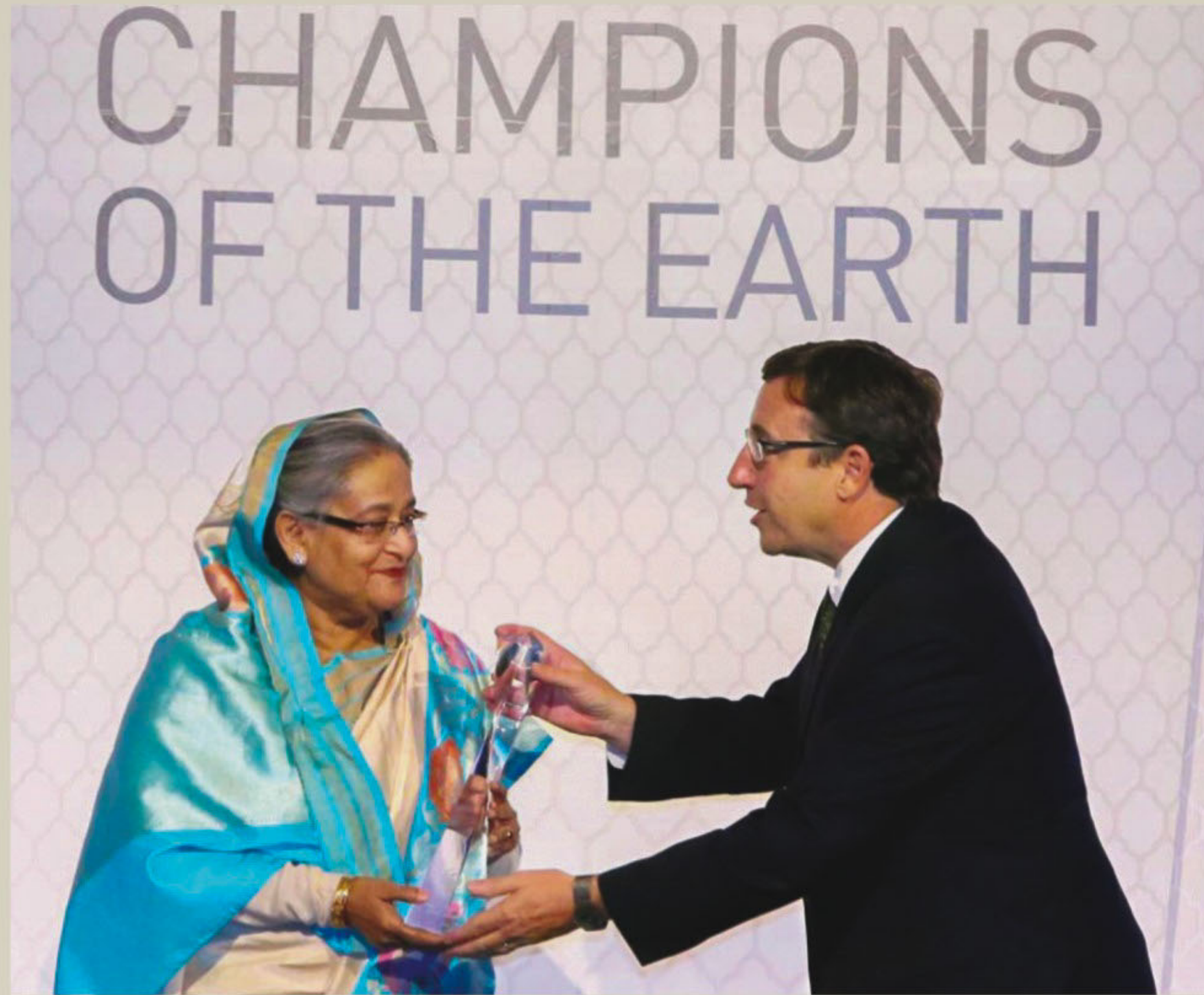
Prime Minister Sheikh Hasina received the highest environmental accolade of the UN – Champions of the Earth – in recognition of Bangladesh's far-reaching initiatives to address climate change (September 27, 2015). On December 2, she was named one of the 100 leading global thinkers of the world by Foreign Policy, a Washington-based magazine.