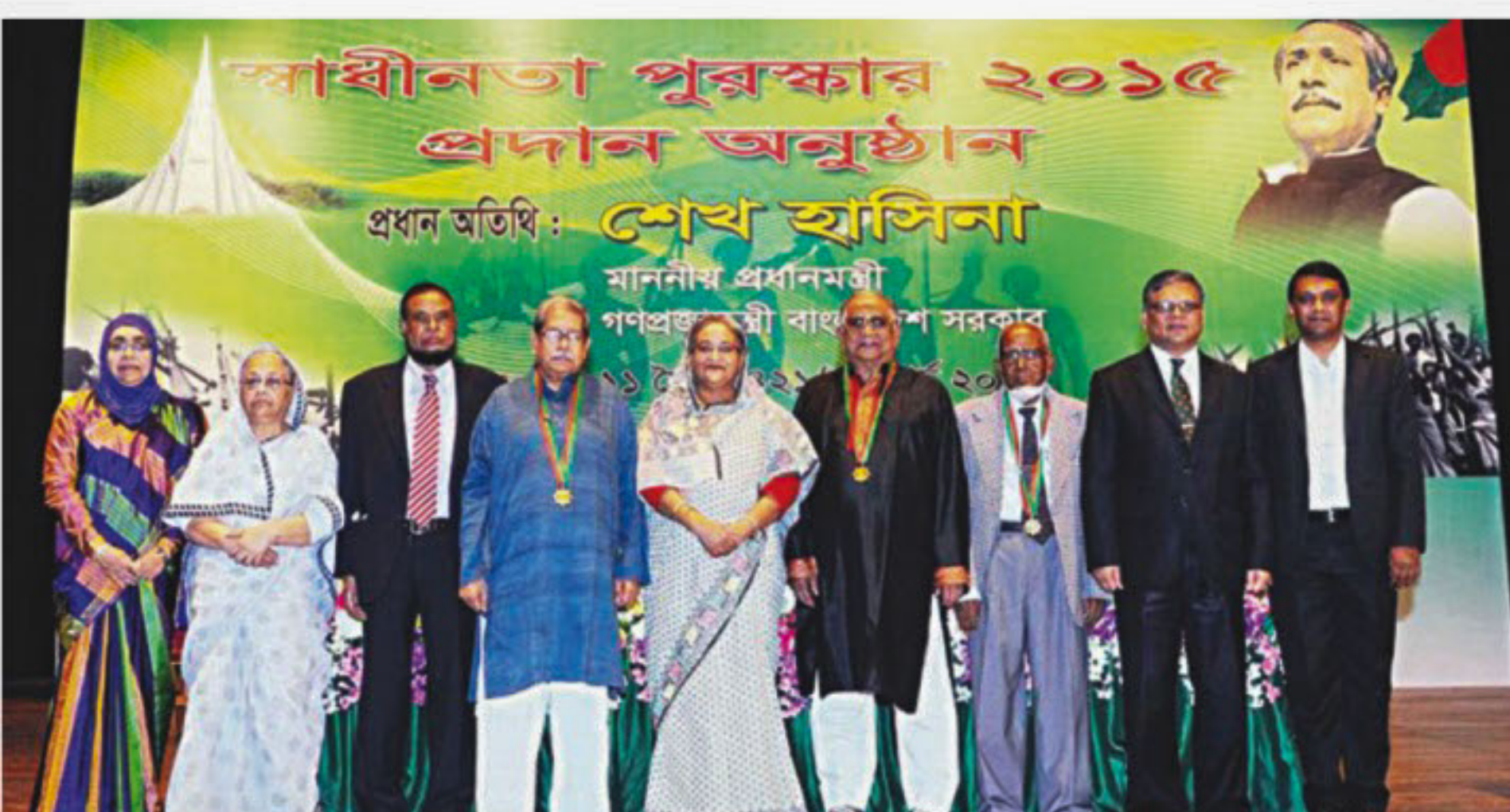
Seven eminent personalities of the country received the Independence Award-2015 in recognition for their outstanding contributions in their respective fields at the national level. (March 25, 2015)