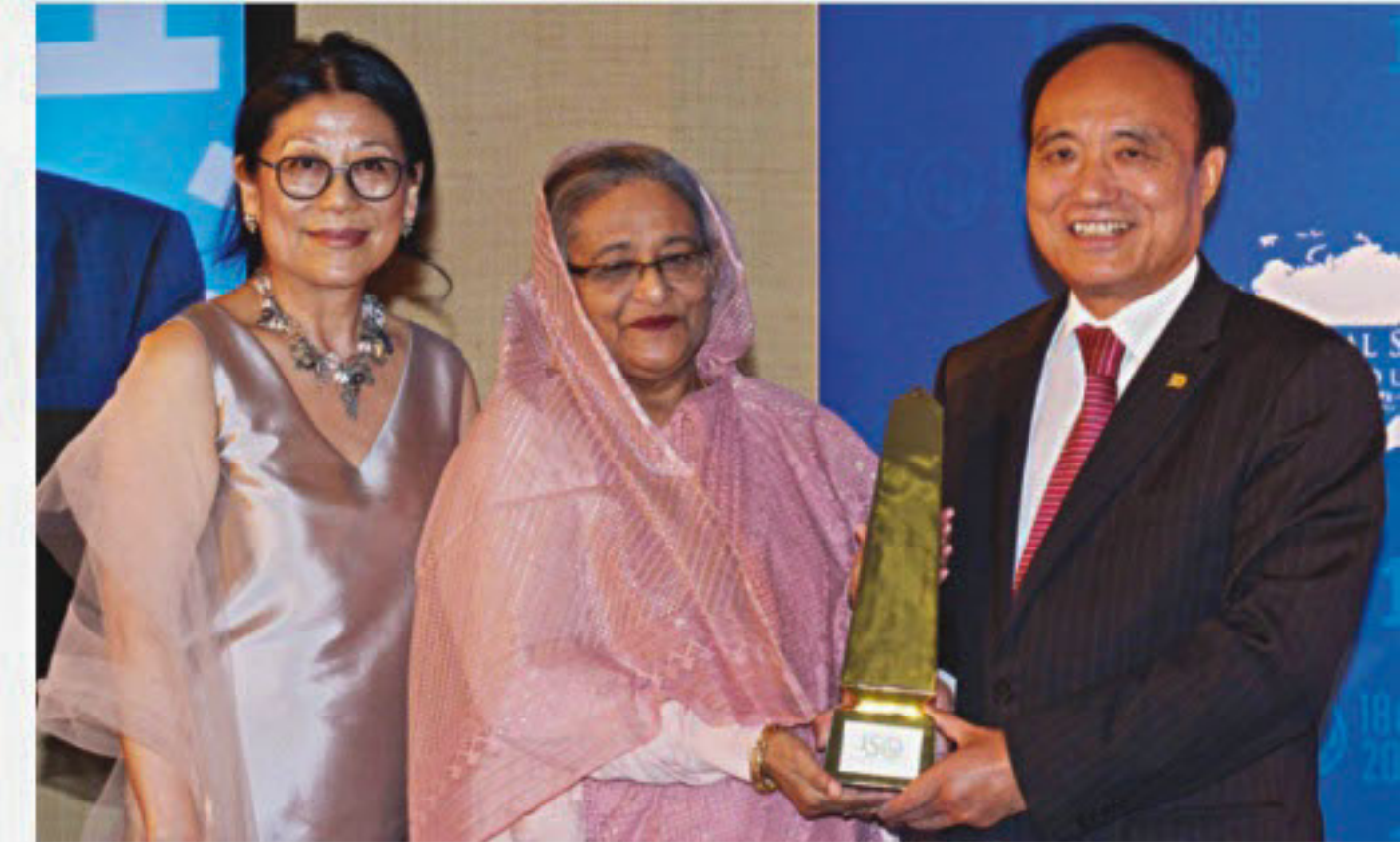
Prime Minister Sheikh Hasina received the ICT Sustainable Development Award from the International Telecommunication Union (ITU). (September 26, 2015)