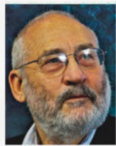
JOSEPH E STIGLITZ

In early 2010, I warned in my book Freefall , which describes the events leading up to the Great Recession, that without the appropriate responses, the world risked sliding into what I called a Great Malaise. Unfortunately, I was right: We didn't do what was needed, and we have ended up precisely where I feared we would.