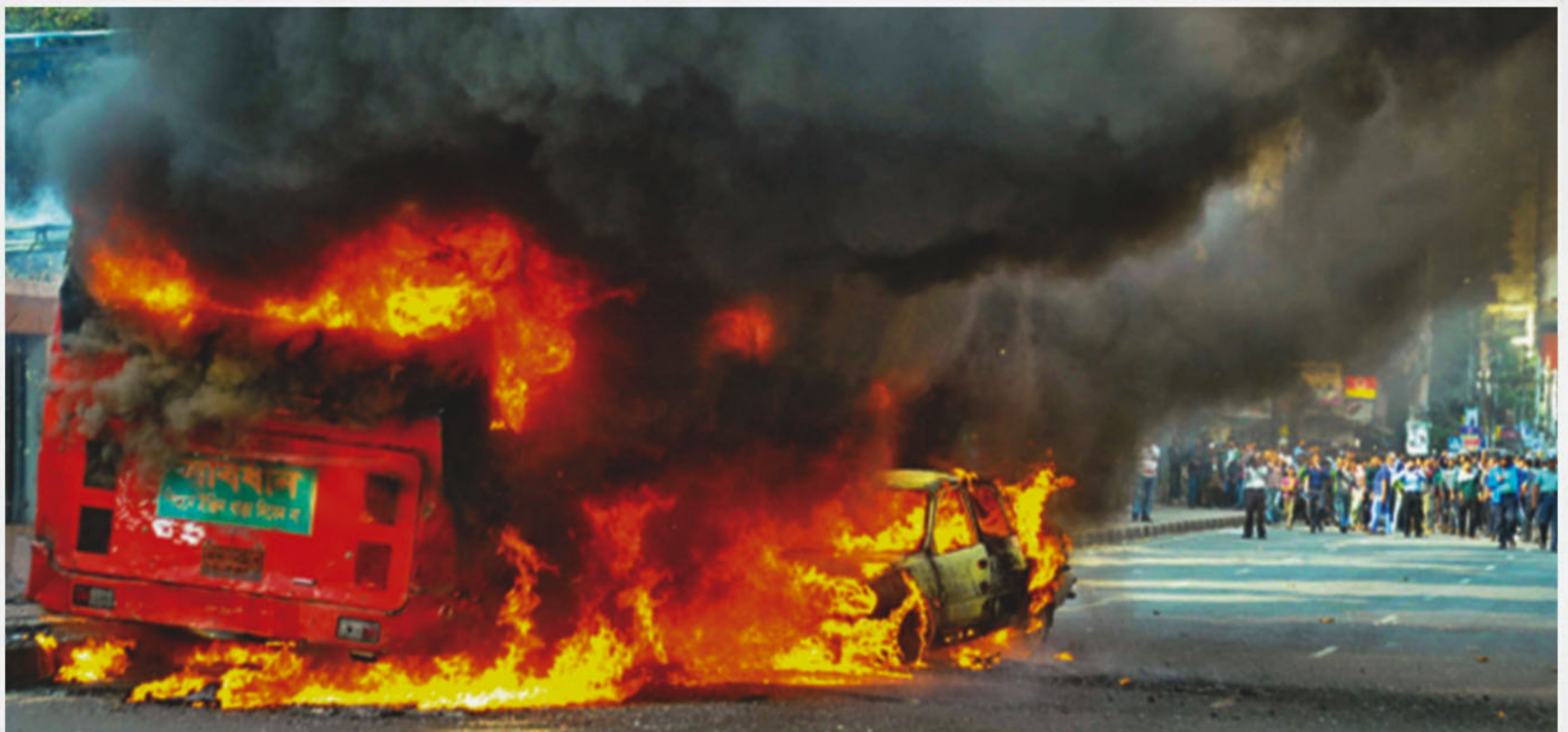
Blockaders set a BRTC bus and a private car on fire in front of Rajuk Bhaban in the capital's Motijheel on January 6, 2015.

It has been alleged that many of the rebels have been harassed so that they drop out of the elections. Amidst major violation of electoral codes by mainly ruling party candidates and their powerful backers, the Election Commission's authority has been severely compromised as it could not take