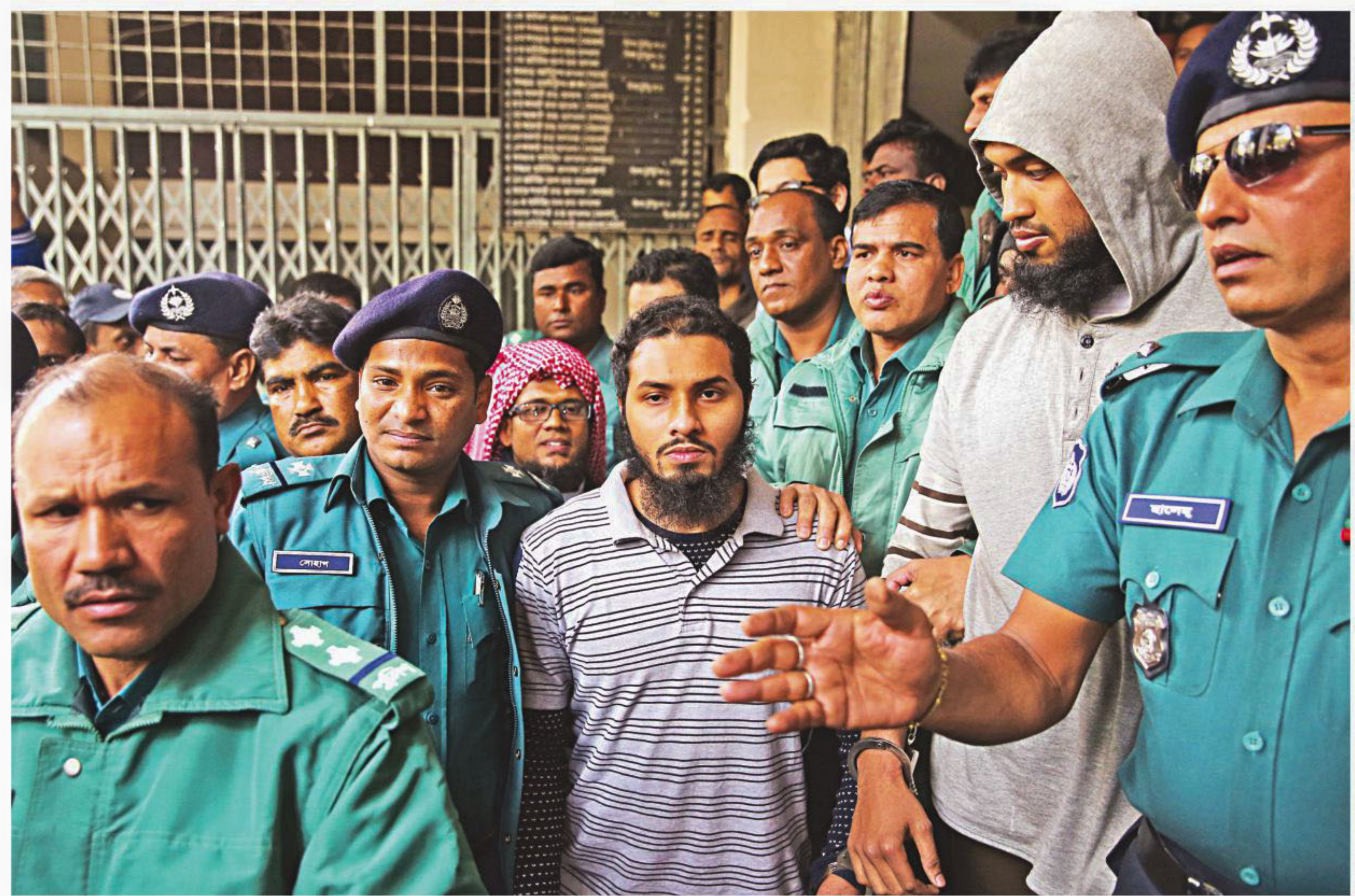
Three of the convicts in blogger Ahmed Rajib Haider murder case are being escorted out by police from the Dhaka Speedy Trial Tribunal-3 yesterday after the verdict. First of the five bloggers killed so far in the country, Rajib was killed on February 15, 2013.

Girls have beaten boys at the top level. Of the total GPA-5 scorers under nine boards, 1,11,303 are girls and 84,960 are boys. The pass rates of girls