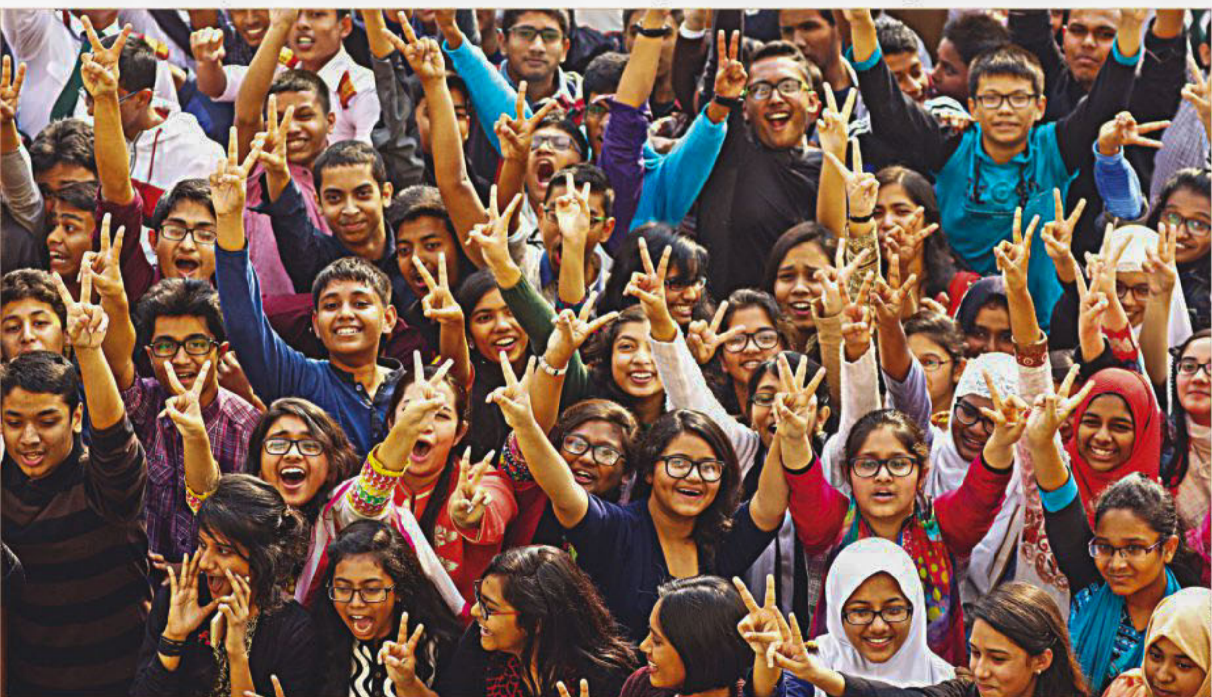
IT'S TIME TO CELEBRATE: Students of Rajuk Uttara Model College rejoice at their results of Junior School Certificate exams yesterday. Over 92 percent students of class eight came out successful in last year's exams.

Girls fare better than boys as pass rates rise to 98pc in primary terminal, 92pc in Junior School Certificate exams of 2015