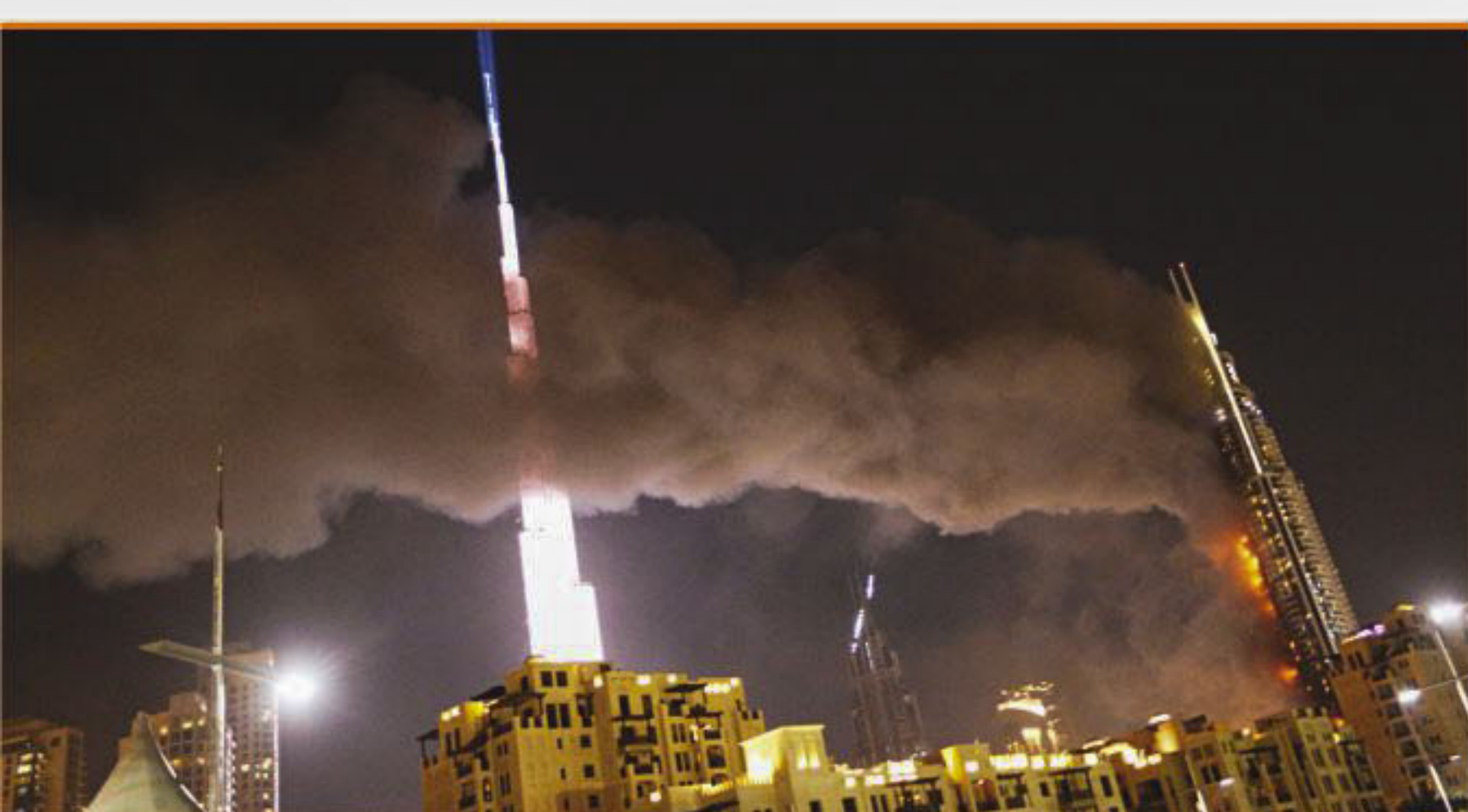
The Address hotel burning after a huge fire ripped through the luxury hotel near the world's tallest tower in Dubai last night.