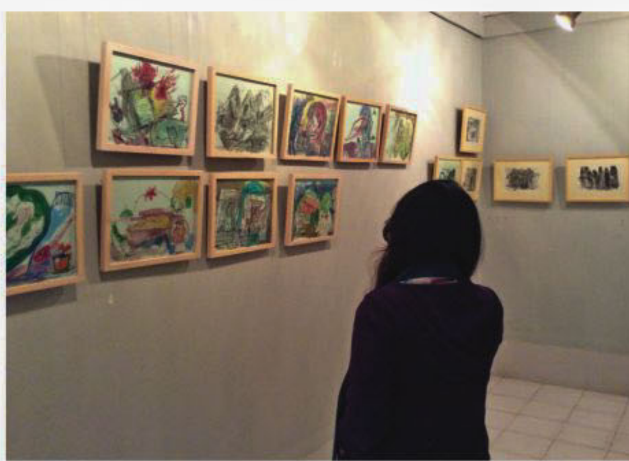
A visitor browses the exhibition.