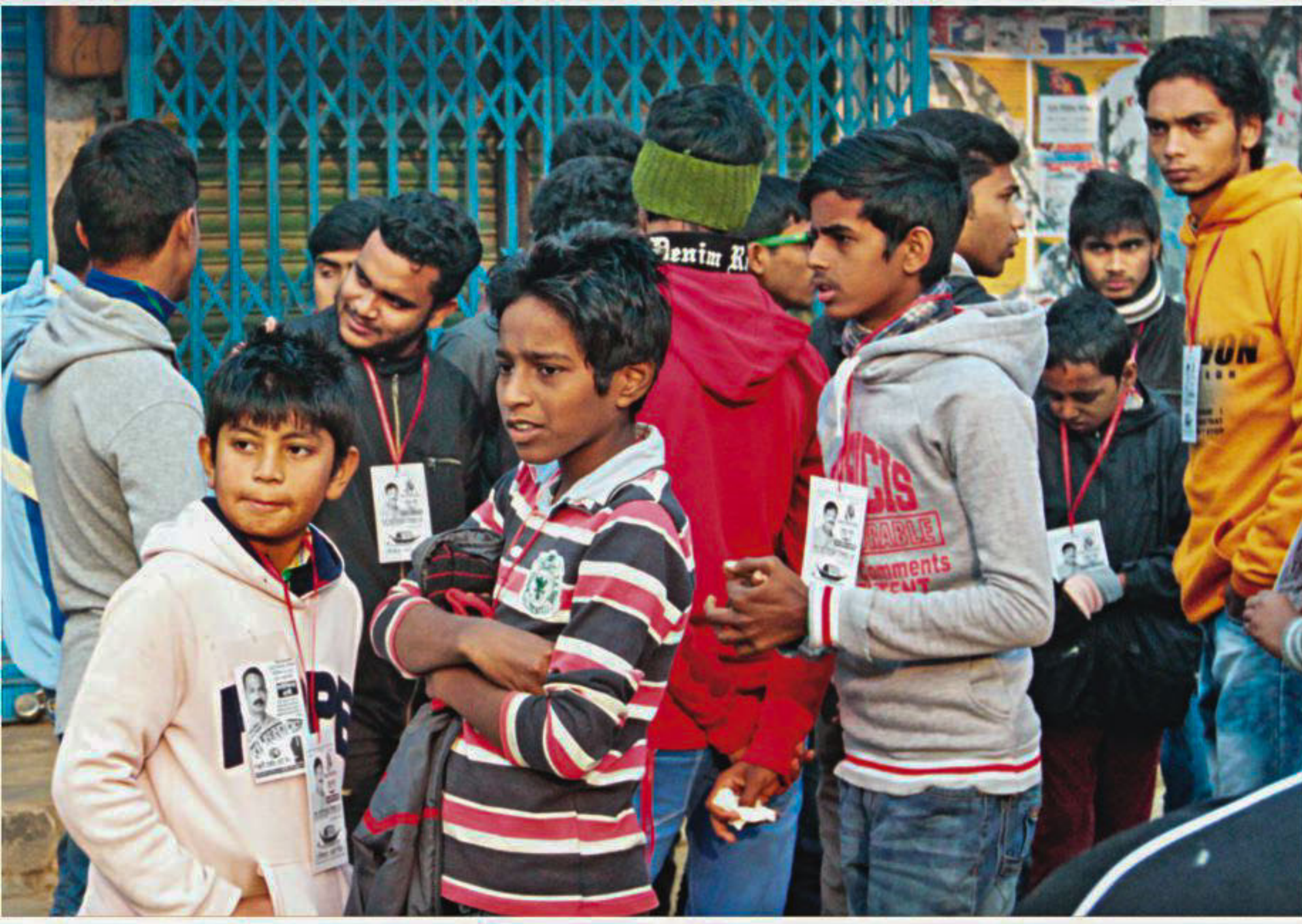
Children engaged in campaigning at the Dinajpur Academy High School polling centre in the town during yesterday's municipality election.