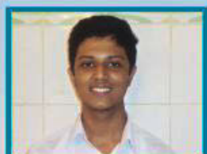
Saad Aslam Dhaka Residential Model College, Dhaka