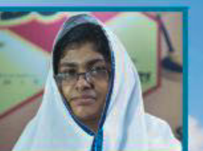
Parisa Islam Mirpur Girls' Ideal Laboratory Institute, Dhaka