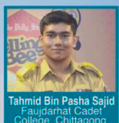
Tahmid Bin Pasha Sajid Faujdarhat Cadet College, Chittagong