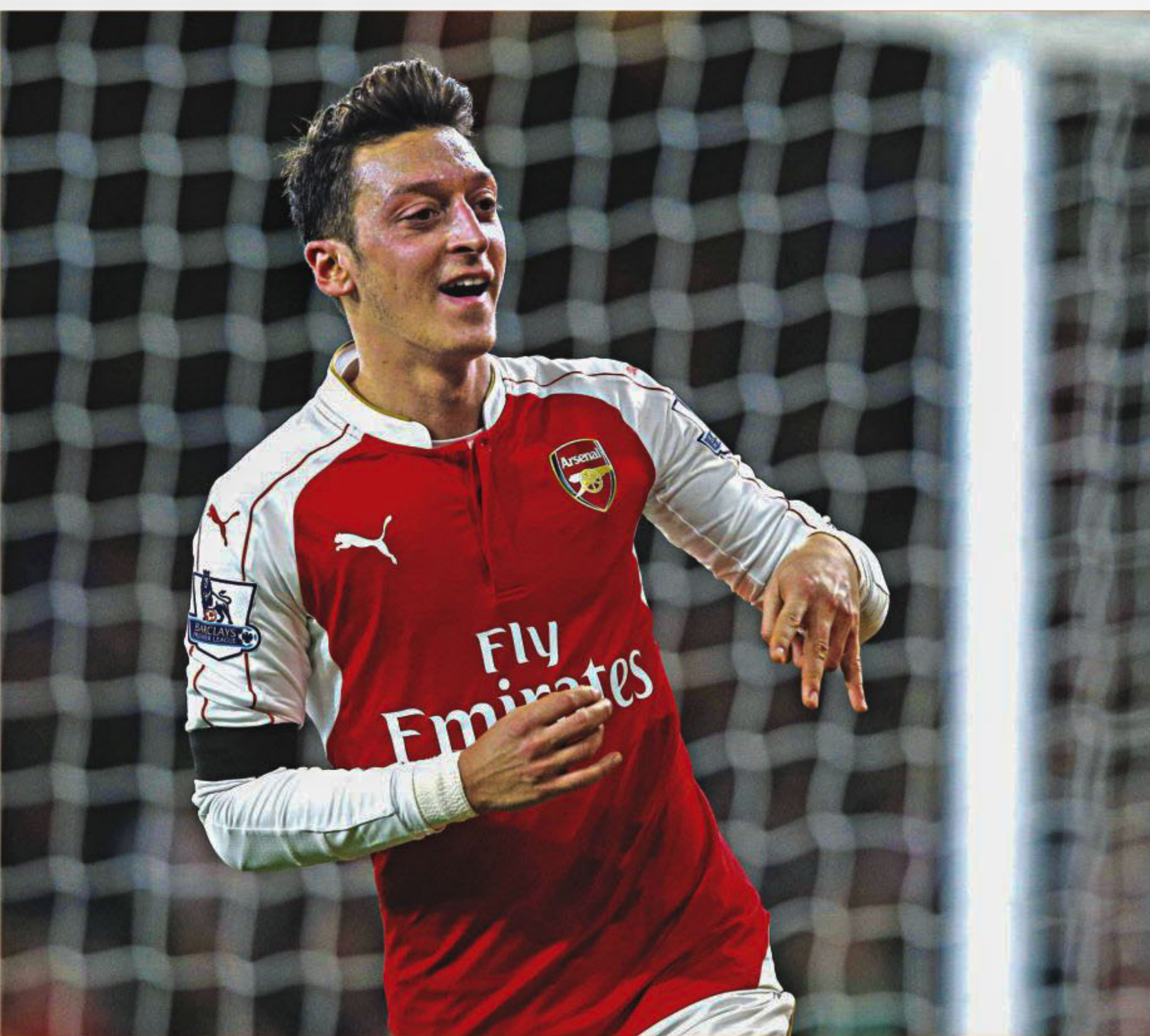
Arsenal playmaker Mesut Ozil celebrates scoring the second goal against Bournemouth during their Premier League encounter at the Emirates Stadium on Monday.