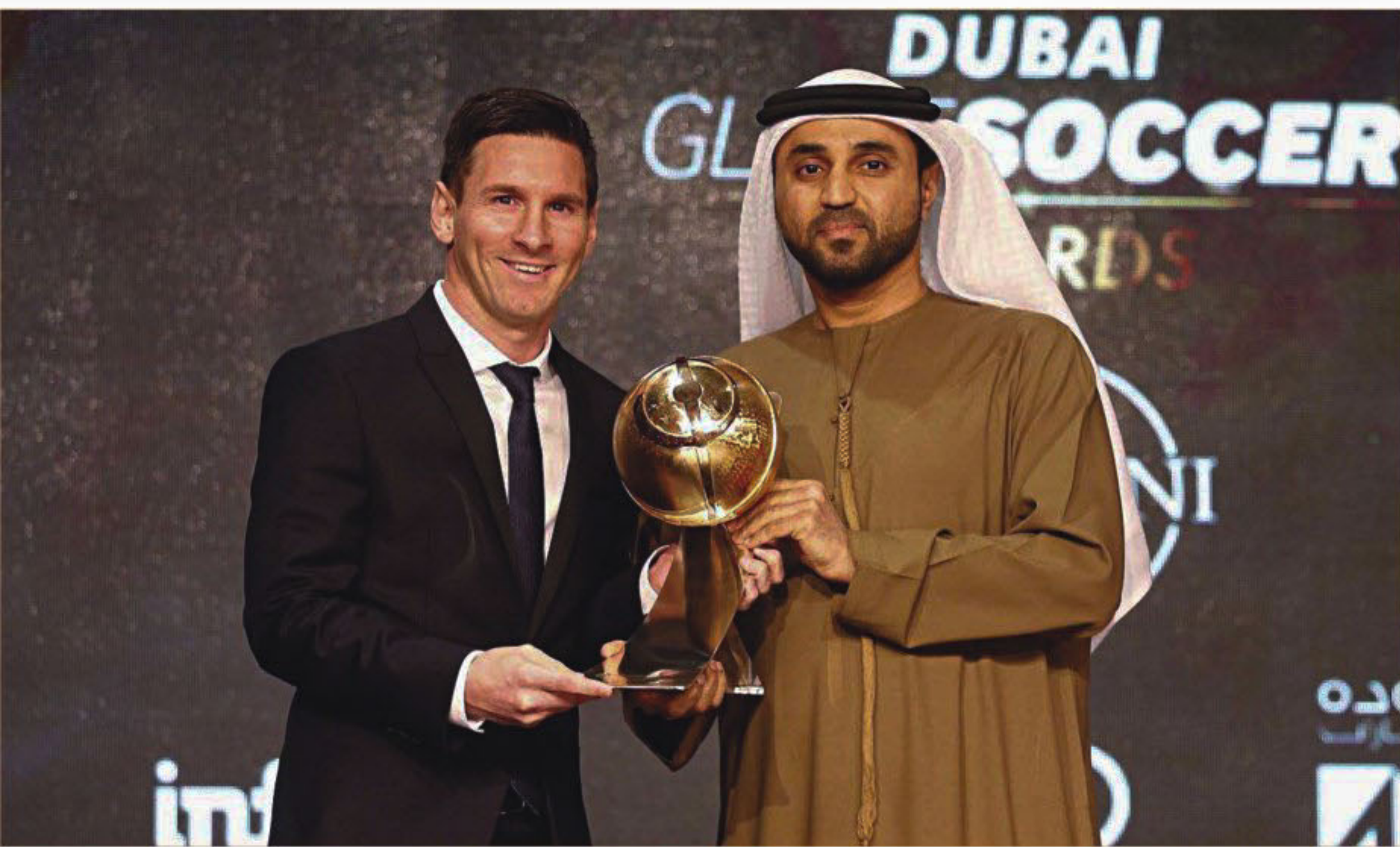
Barcelona superstar Lionel Messi (L) receives the best player of the year trophy during the Dubai Globe Soccer award ceremony in Dubai on Sunday.

Jorge Mendes was handed the award for Best Agent of the Year, while Portuguese club Benfica were named as the Best Academy of the Year.