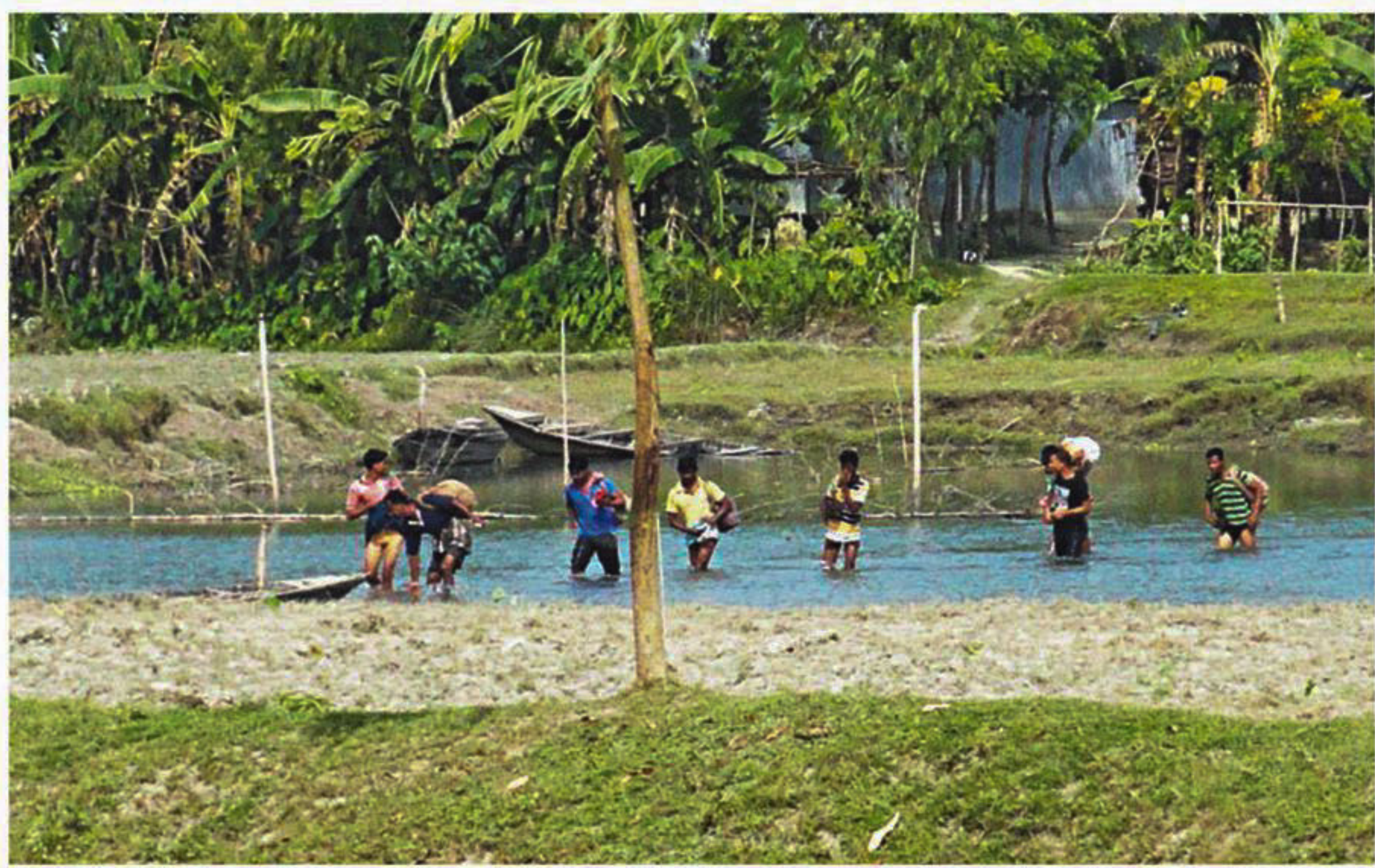
With sacks of phensedyl bottles, drug peddlers crossing the Giridhari river in Jari Dharla of India's Cooch Behar to enter Bangladesh. The photo was taken from the no-man's-land near Mogholhat border in Lalmonirhat Sadar upazila last week.