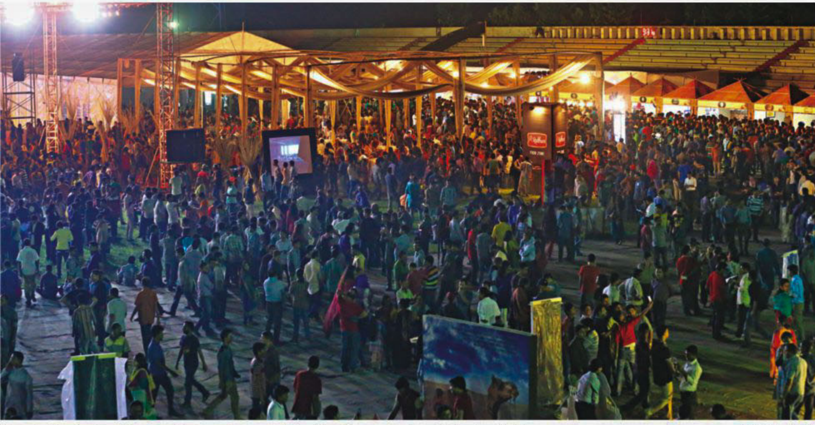
People flocked in thousands to enjoy music under the open sky at the festivals.