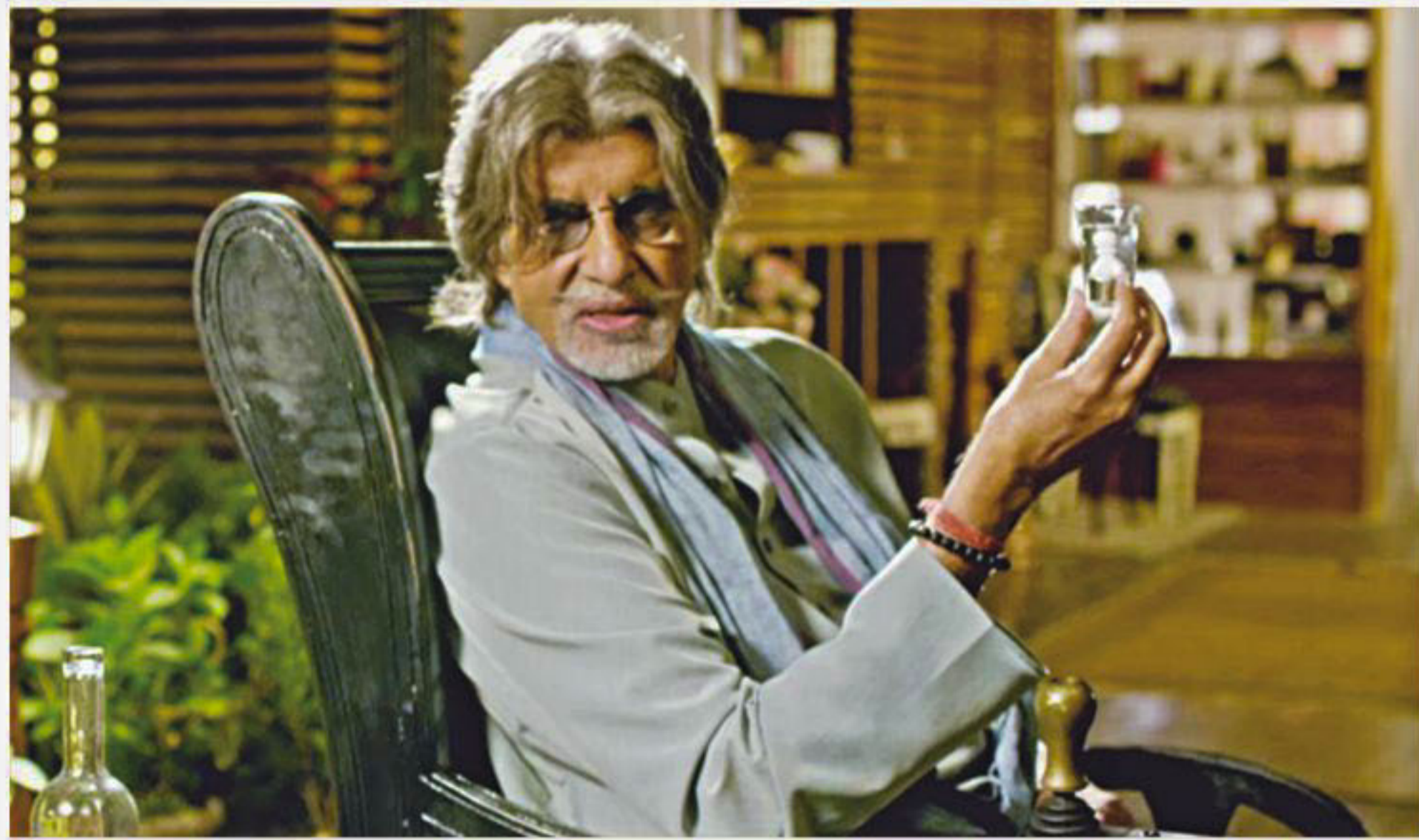
Amitabh plays a paralysed chess grandmaster in "Wazir".