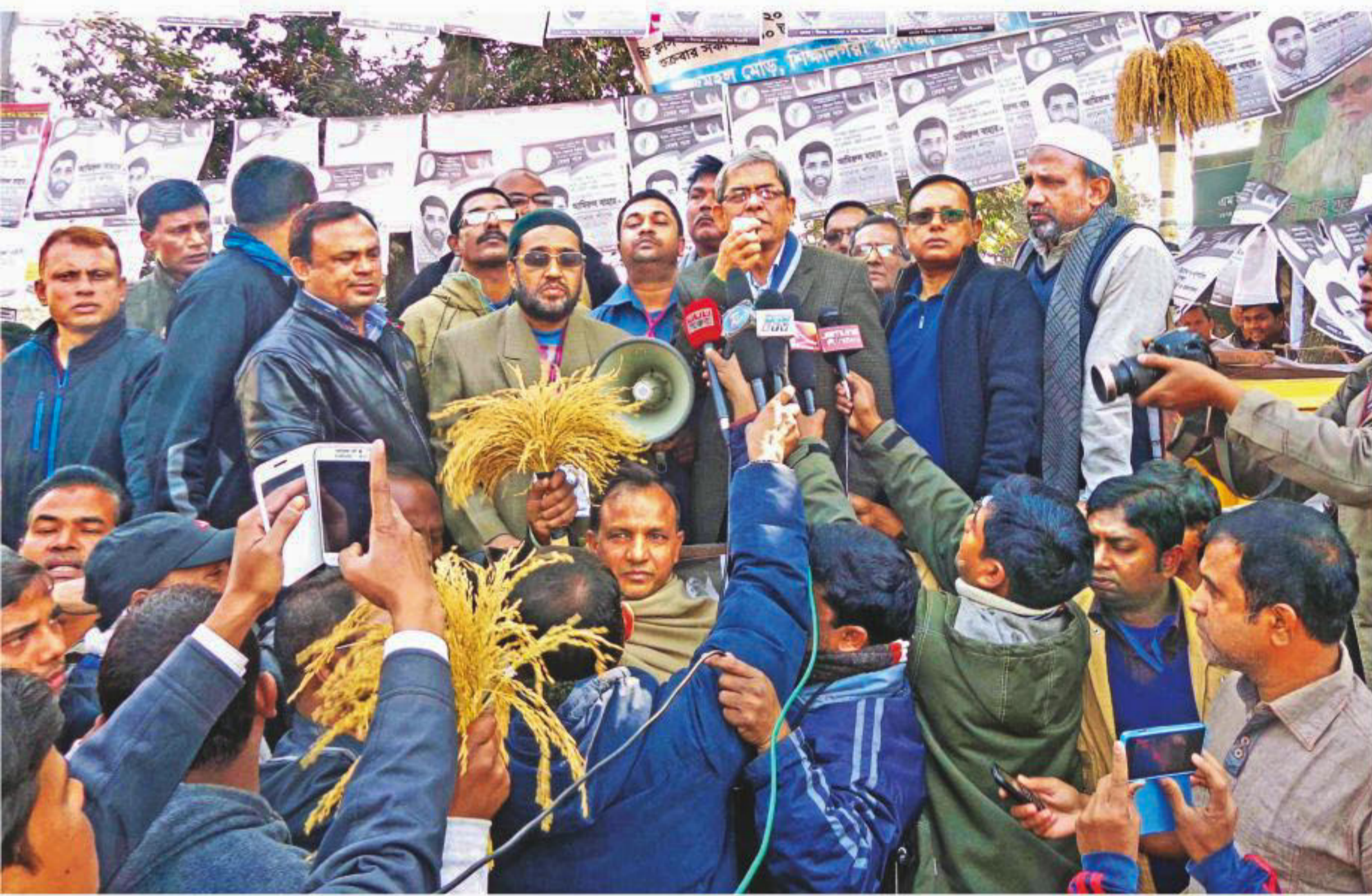
Mirza Fakhru Islam Alamgir giving a pep talk at a campaign rally in Birganj municipality of Dinajpur on Friday for BNP's mayor candidate. The acting secretary general of BNP also campaigned at a few other rallies in the district.