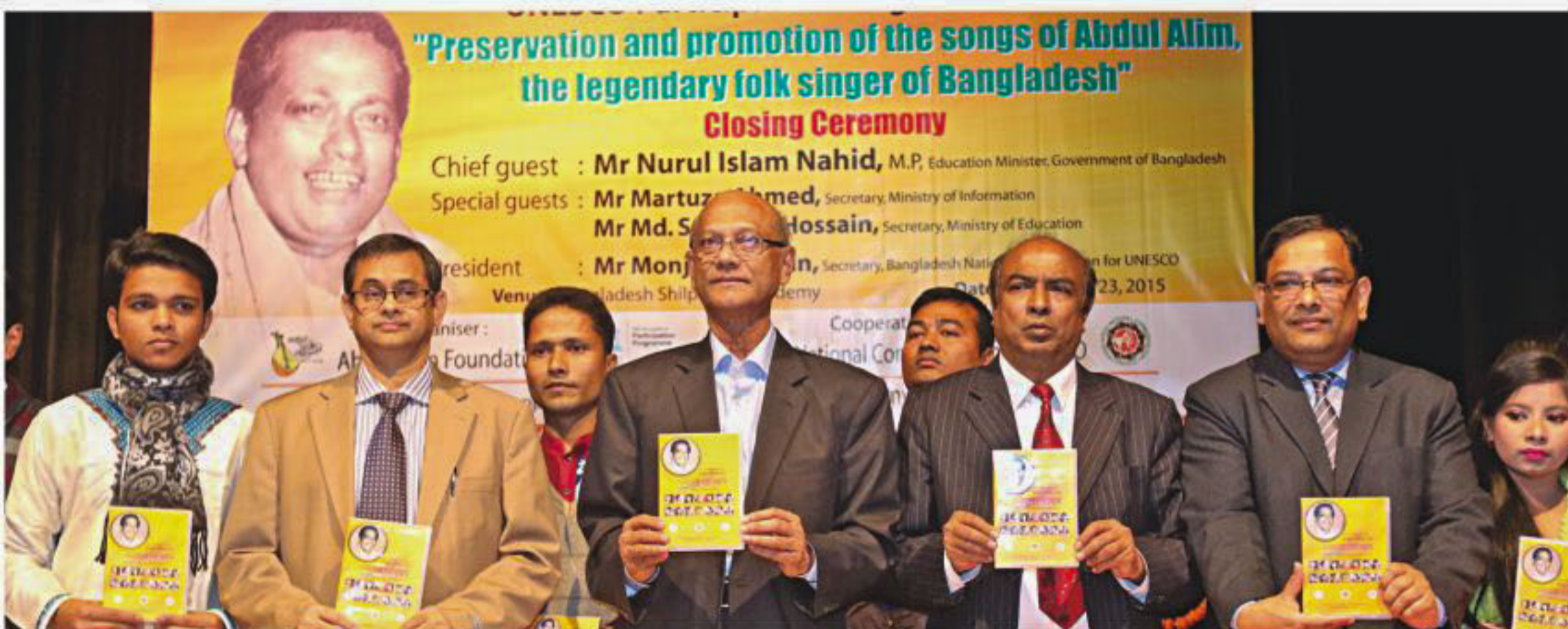
Guests at the book launch.

Under the UNESCO Participation Programme 2014-2015, the organisers jointly worked on the theme "Preservation and promotion of the songs of Abdul Alim, the legendary folk singer of Bangladesh." Later, the singers, who recorded songs for the DVD, performed songs at the event.