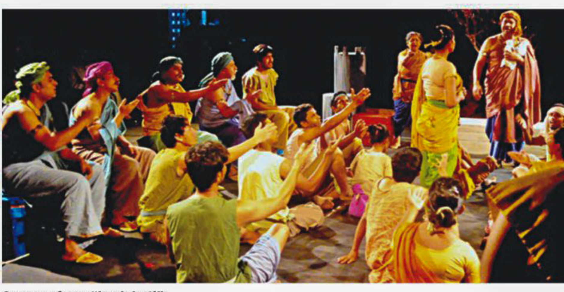
A scene from "Leelaboti".