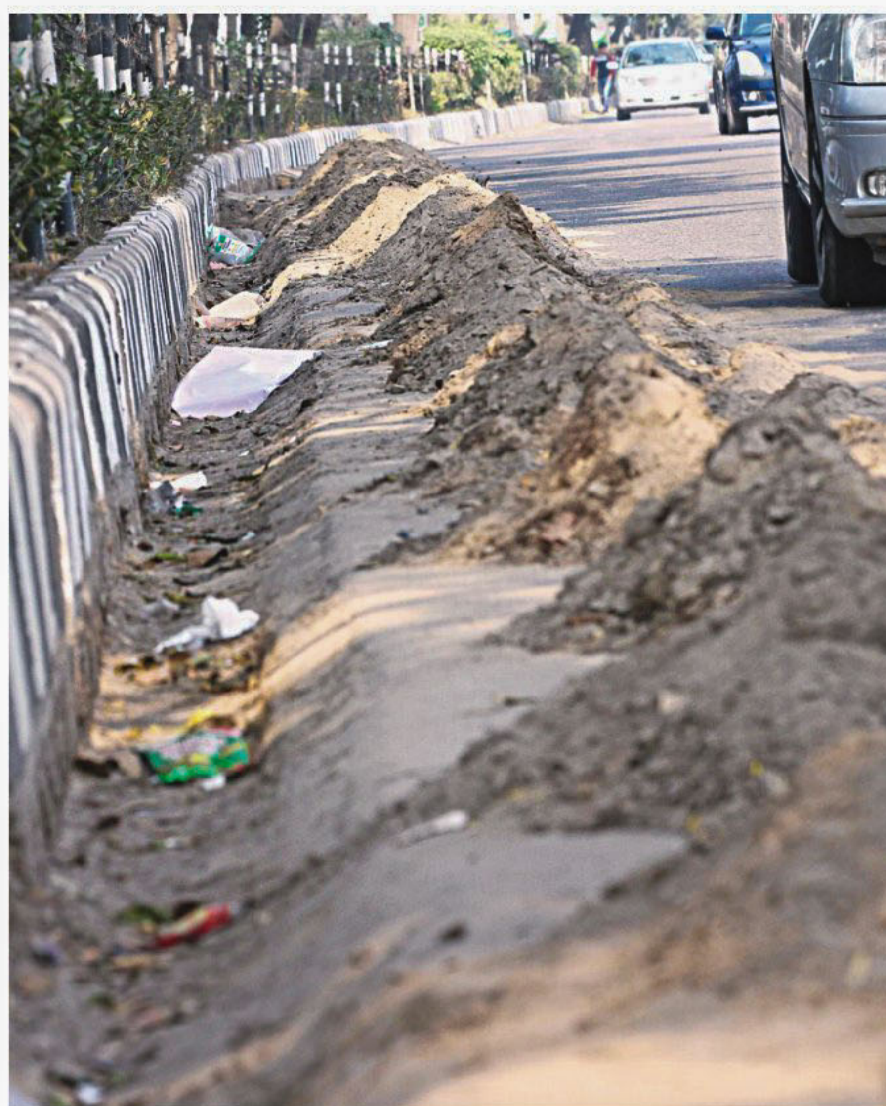
The muck dug up from the gutter of the capital's Rokeya Sarani has remained on the road for two days and the piles are going back to the same place as those are yet to be removed by the city corporation. The photo was taken near IDB Bhaban yesterday.