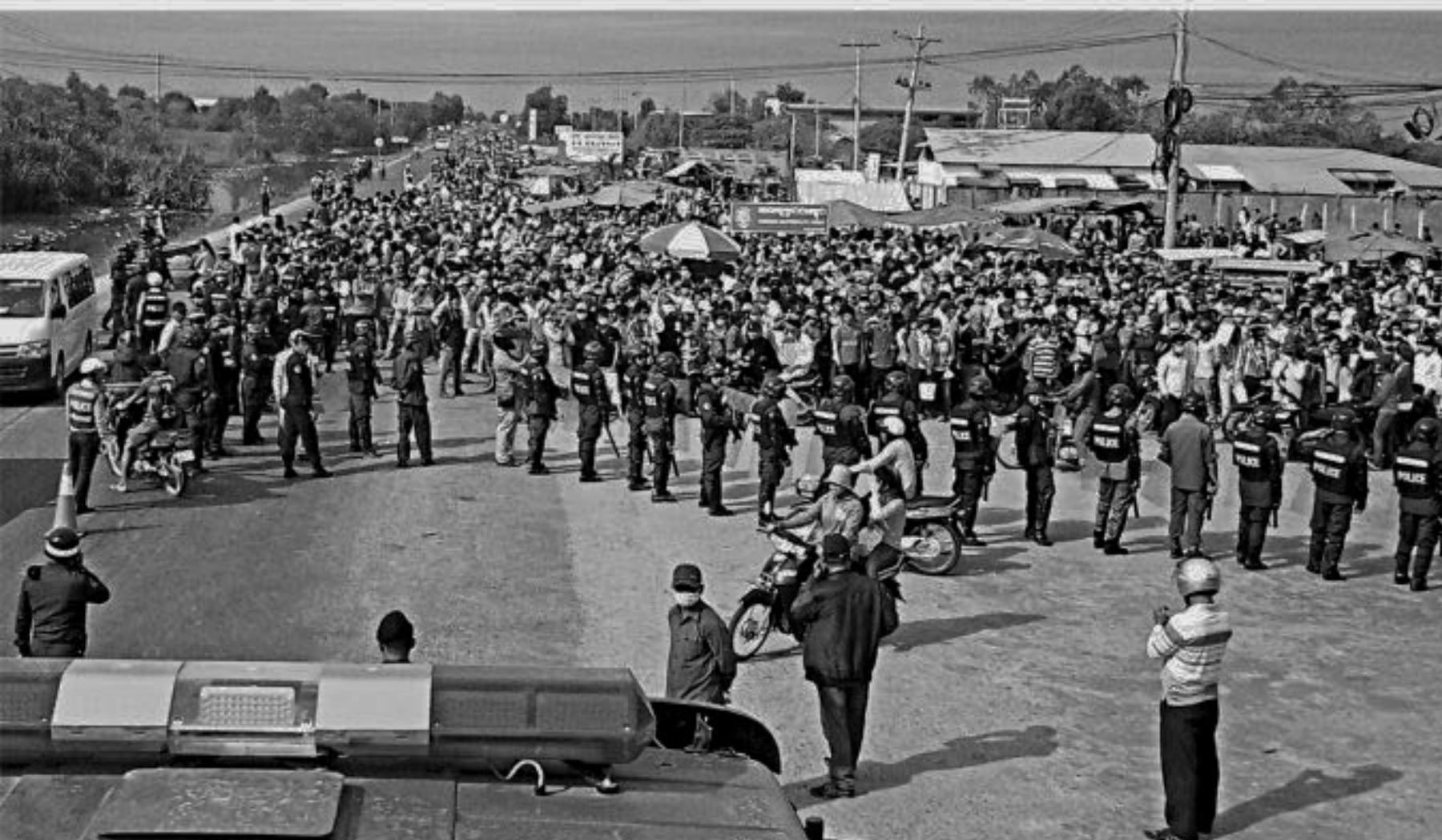
Cambodian workers stand in front of police officials during a protest in Svay Rieng province yesterday.

Police in Cambodia made dozens of arrests and used water cannon to break up a strike on Monday by garment workers protesting over low pay, in the latest flare-up in a manufacturing sector vital to its fledgling economy.