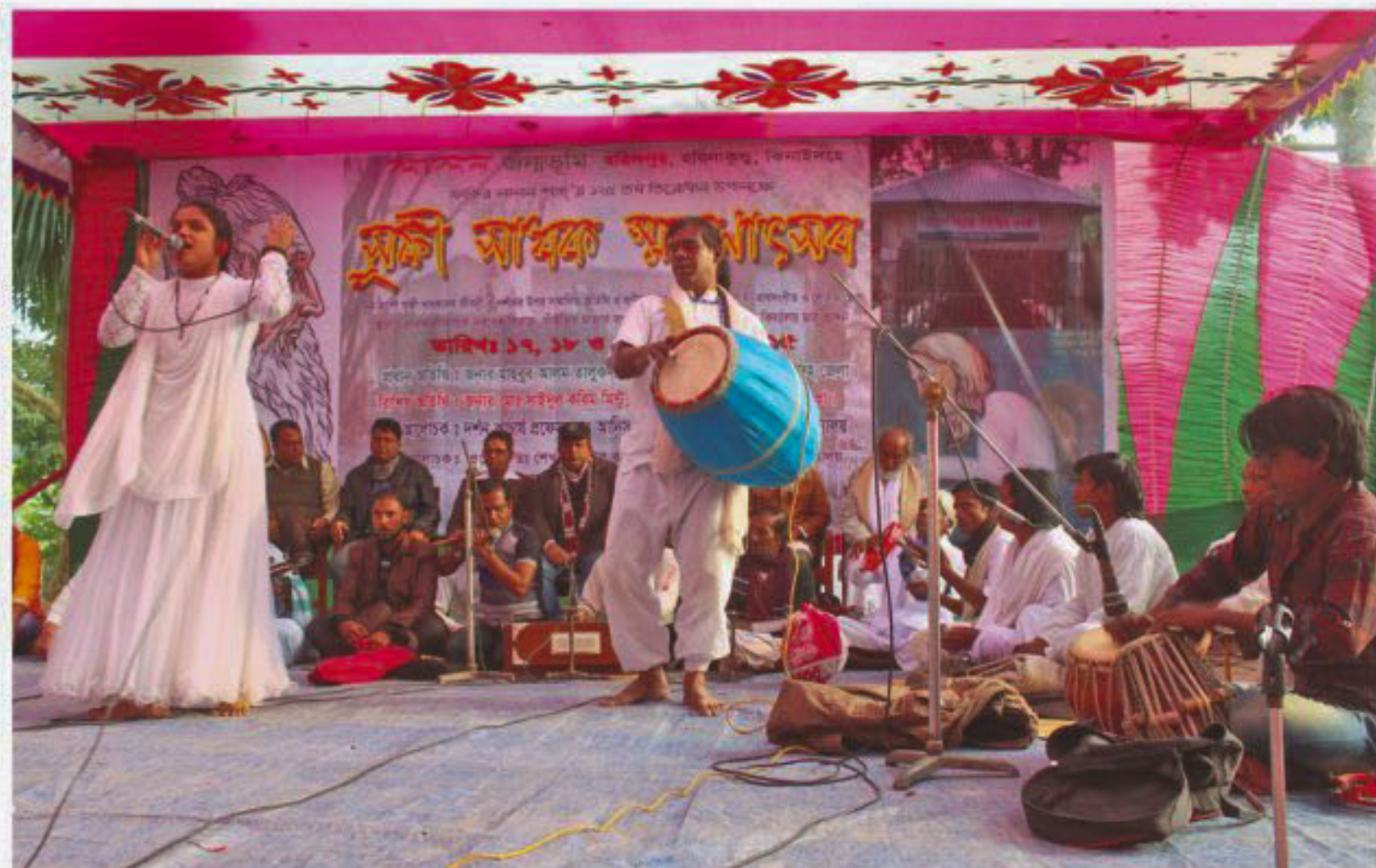
A Lalon devotee performs songs at the festival.