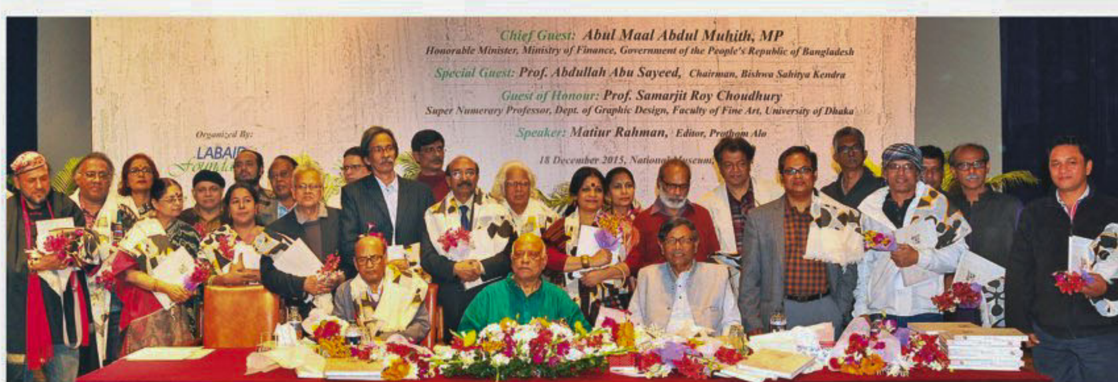
Guests with the artists at the inauguration.