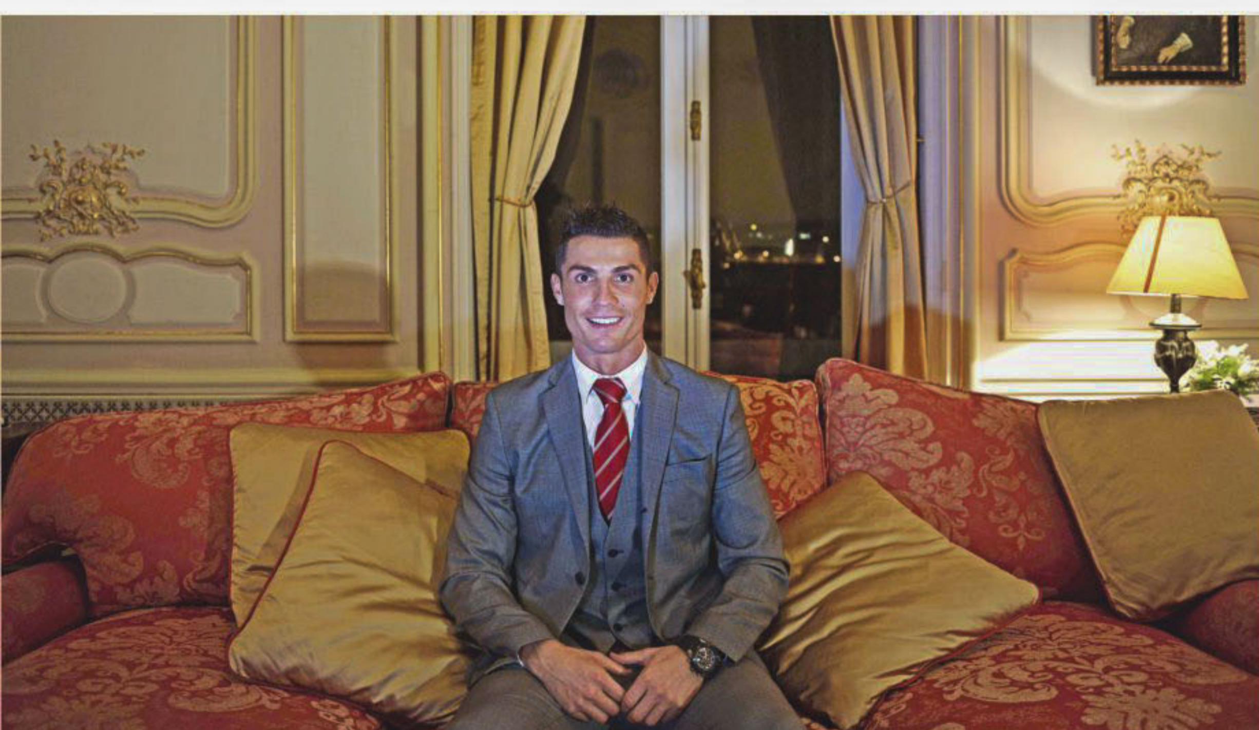
Real Madrid superstar Cristiano Ronaldo smiles as he poses for a photo at the Pestana Hotel Palace in Lisbon on Thursday.