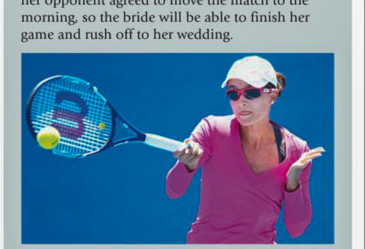
Compiled by Star Sport Desk