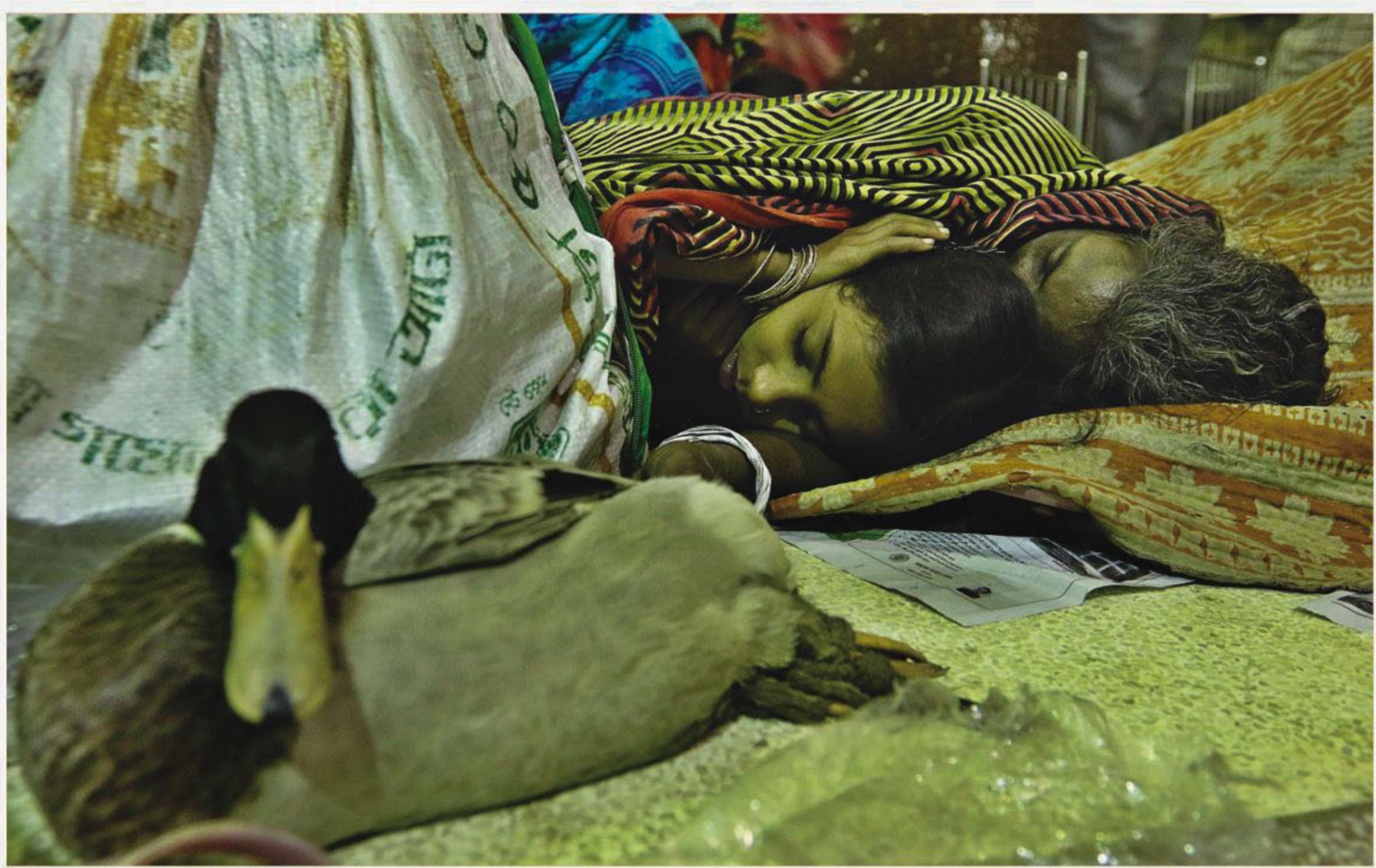
With nothing warmer available, a woman and her child wrap themselves in a worn-out sari as they make the platform of Kamalapur Railway Station their bed. The photo taken on Wednesday night gives a glimpse of how miserable the lives of the city's underprivileged are becoming with the winter setting in.

He recounted how the airdrop was made during the day, ahead of the scheduled time at night. He explained that airdropping by the day increased the risk of being caught or shot at but their visibility greatly helped to infuse fear in the minds of the enemy who overestimated their exact number. The attack was successful and they thwarted the Pakistan army from advancing towards the