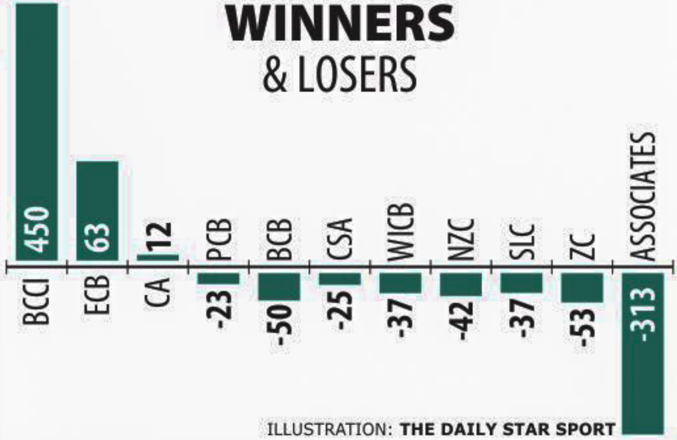
ILLUSTRATION: THE DAILY STAR SPORT