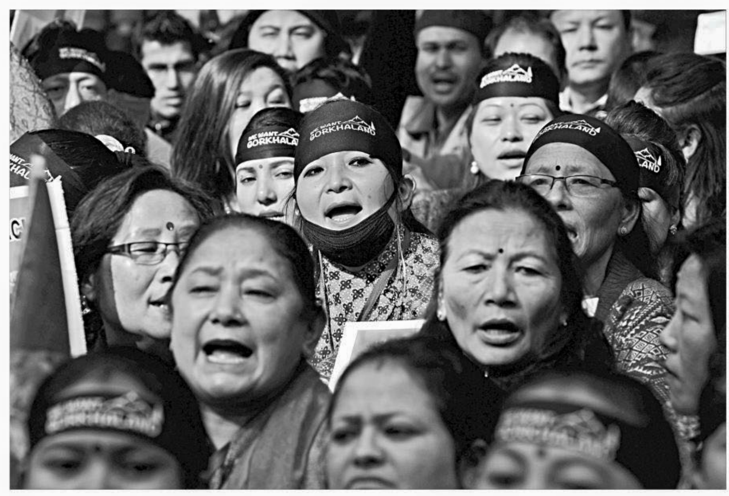
Indian Gorkha activists shout slogans to voice their demands for a separate Gorkha state in northern West Bengal during a protest in New Delhi, yesterday. The Gorkha people are demanding a separate state in the Darjeeling area of the state of West Bengal, which would be named Gorkhaland.

AGENCIES India's Defence Acquisition Council has cleared the purchase of five S-400 air defence systems from Russia, two defence ministry sources said yesterday. One of the sources, speaking on the condition of anonymity, said the deal is expected to cost around 300 billion rupees ($4.52 billion) but that the final price tag would be negotiated during the procurement process, reports Reuters. India's air defences are old and outdated and Prime Minister Narendra Modi, who heads to Moscow later this month to meet Russian President Vladimir Putin, is keen to modernise the country's defences against airborne attacks. Sources said the acquisition of the S-400 system, which has a range from 40 to 400 km, depending on the missile fired, could be through the Request for Proposals (RFP) or government-to-government route. The acquisition will be discussed between Modi and Putin and may figure in the joint statement. Although the military had earlier projected a requirement of a dozen S-400 systems, the defence ministry is clear that only five systems are sufficient to take care of the future airborne threat from across India's borders, reports Hindustan Times. The S-400 is a proven anti-aircraft system, and is widely considered the most advanced of its kind in the world, with the capability of engaging missiles as well as aircraft. It comes with a mobile launcher and a threat detection radar-command centre. The deal includes purchase of some 6,000 missiles from Russia.