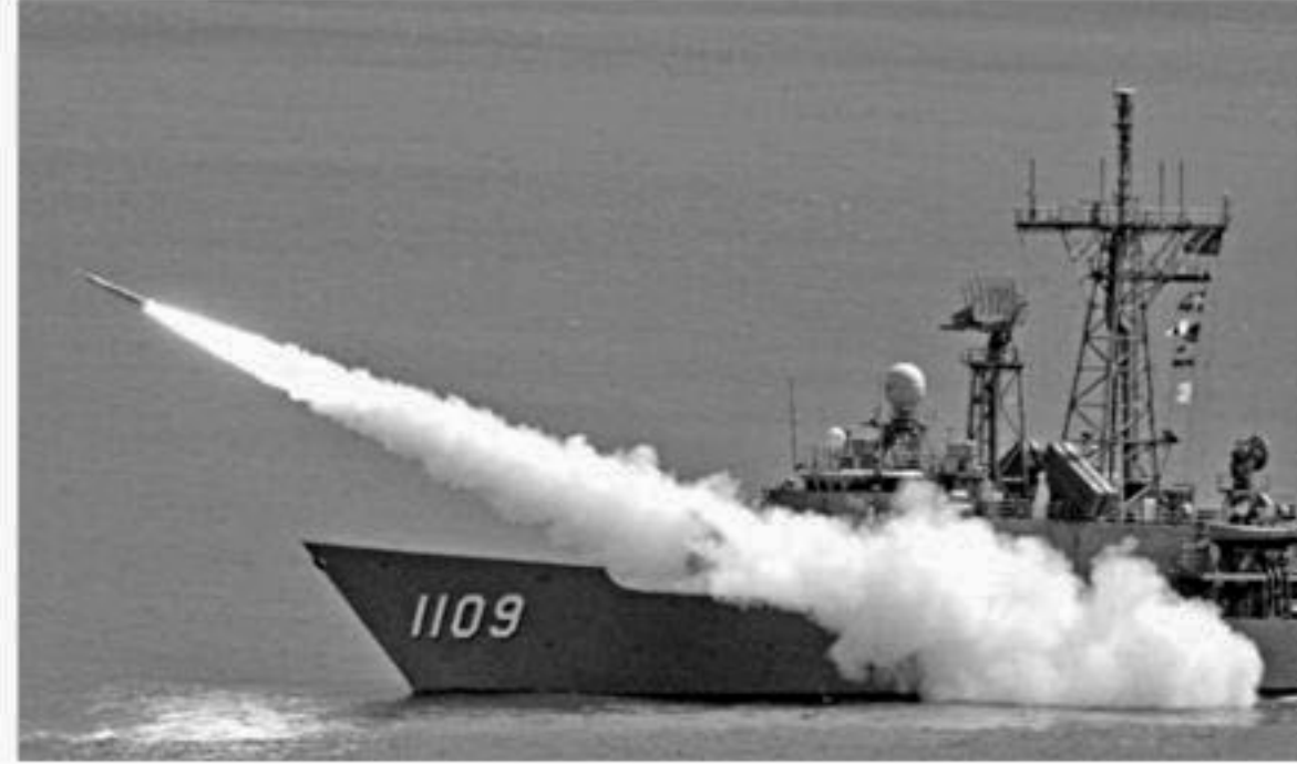
In this undated photo, a missile is being launched from a Taiwanese frigate during a wargame.

The US weapons sale -- the first to Taiwan in four years -- comes at an increasingly febrile time in East Asia, where China's aggressive position on territorial disputes with its neighbours has raised anxiety levels in the US and among allies from Japan to the Philippines. Beijing is building islands with military-grade airstrips in the South China Sea, part of what observers say is an attempt to assert control over almost the whole of the body of water. Several countries -- along with Taiwan -- also claim parts of the sea. The US and its allies have carried out high-profile overflights of the sea, nearing the artificial islands, in what they say are routine "freedom of navigation" exercises in international waters. Beijing says they are provocations and infringements of Chinese sovereignty. In their meeting on Wednesday, Vice Foreign Minister Zheng Zuguang told Lee the weapons deal "severely goes against international law and the basic norms of international relations", adding that it "severely harms China's sovereignty and security interests". Washington, which is bound by domestic laws to supply defence materials to