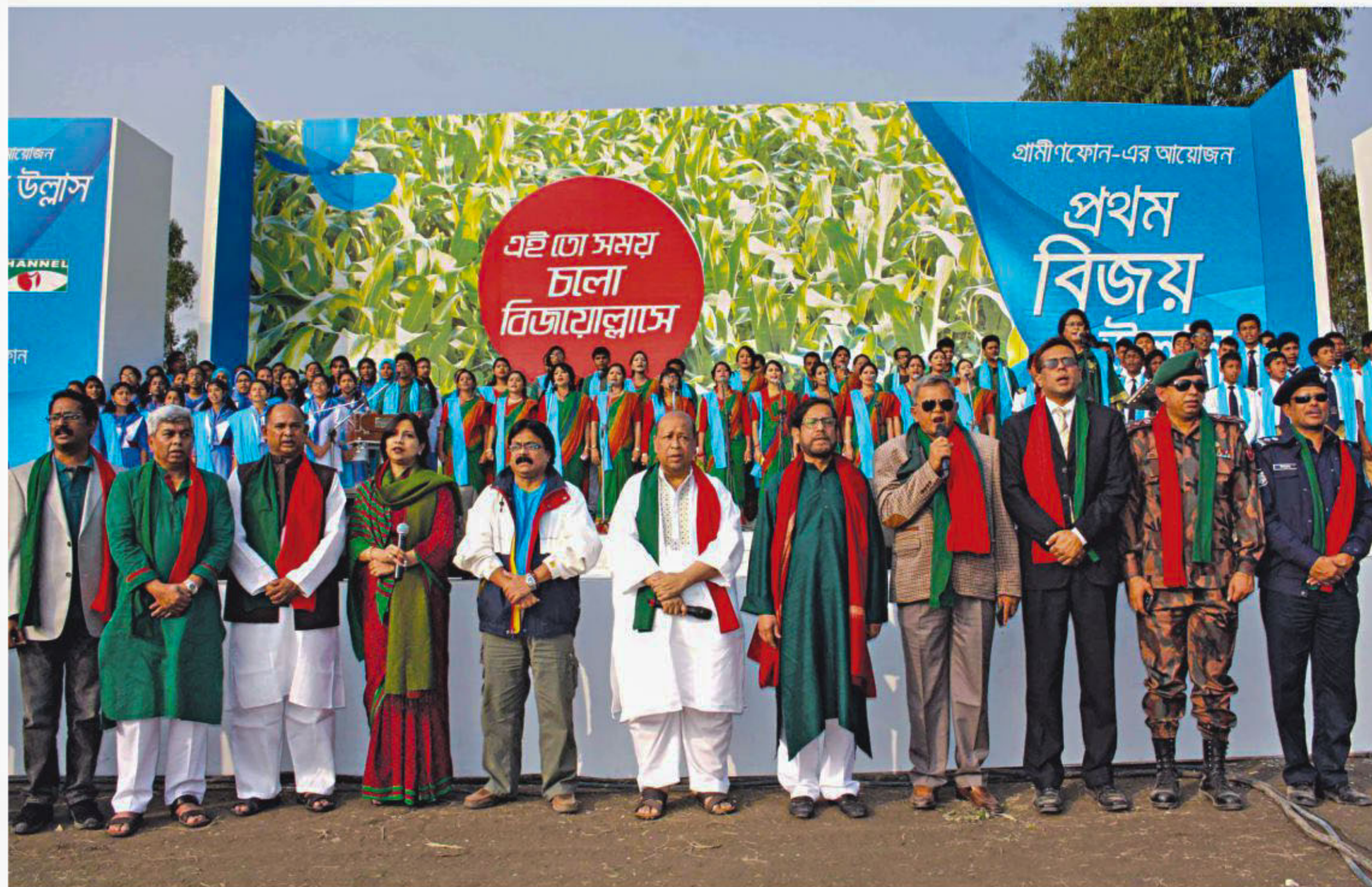
Cultural Affairs Minister Asaduzzaman Nur, fifth from right, and State Minister for Posts and Telecommunications Tarana Halim, fourth from left, among others, sing the national anthem at a Victory Day celebration programme at Garati in Panchagarh. Channel-i and Grameenphone, in association with the cultural affairs ministry, yesterday organised the first ever V-Day event in Garati, a former Indian enclave that became part of Bangladesh this year.