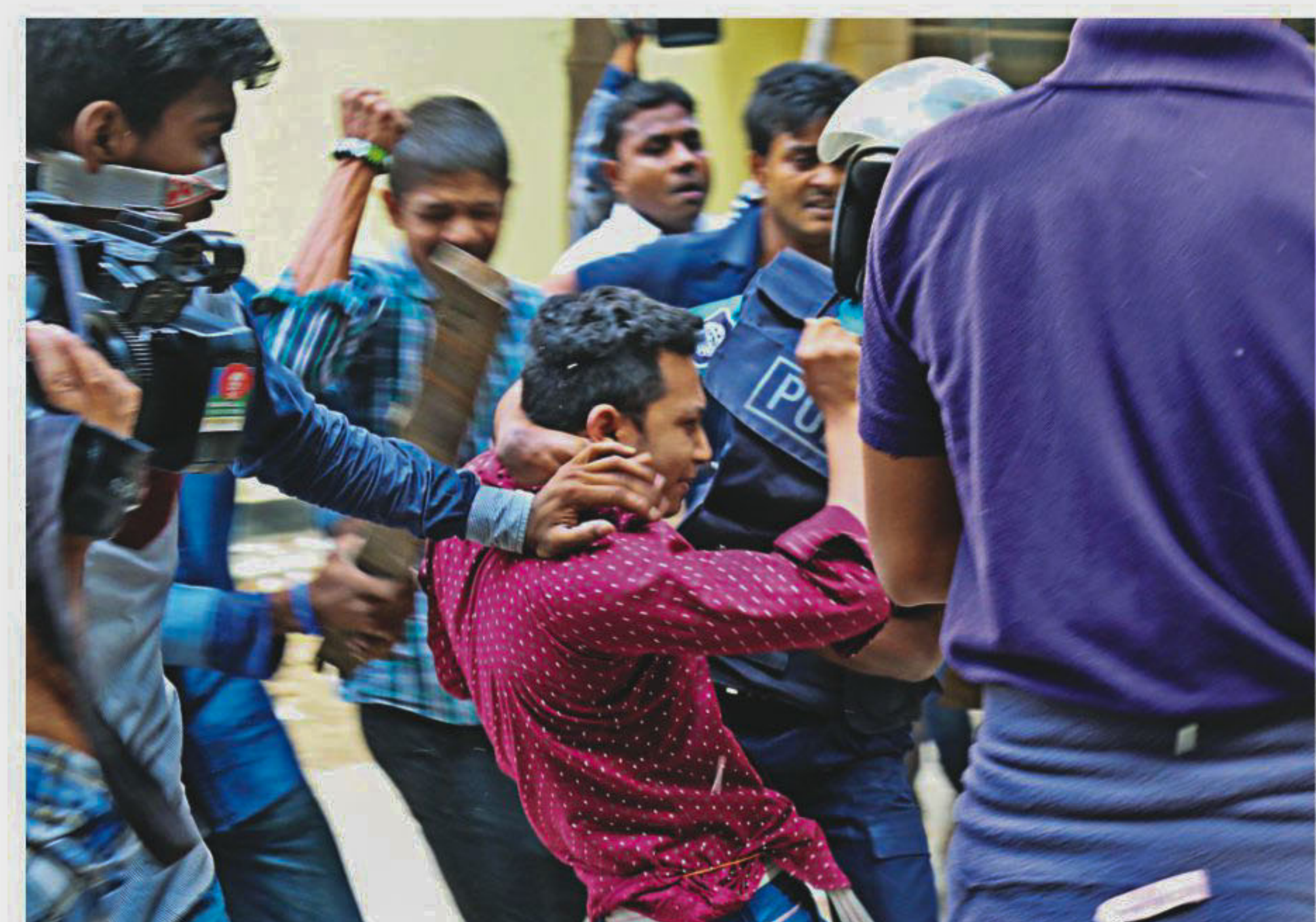
Some Chhatra League men beating up an Islami Chhatra Shibir activist during a clash at the Shaheed Minar of Chittagong College on the Victory Day yesterday. The violence between the student fronts of the Awami League and the Jamaat-e-Islami left three injured and prompted the college authorities to vacate the dormitories.

"We believe strongly that humans should be the only ones to decide to when use lethal force. But when you're under attack, especially at machine speeds, we want to have a machine that can protect us."