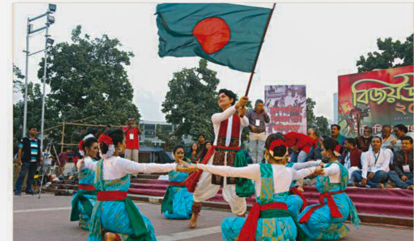
Artistes perform a group dance at Shaheed Minar.