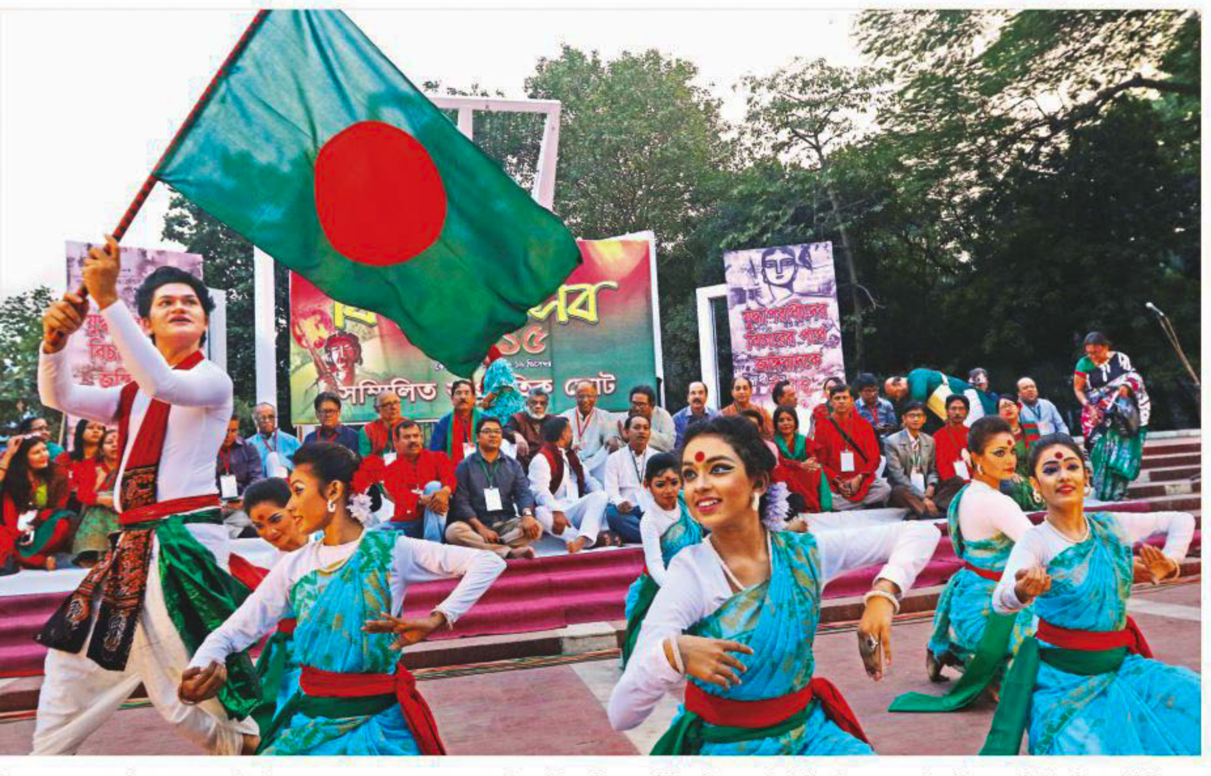
Dancers perform at a daylong programme organised by Sammilita Sangskritik Jote on the Central Shaheed Minar premises in the capital yesterday ahead of Victory Day on Wednesday.