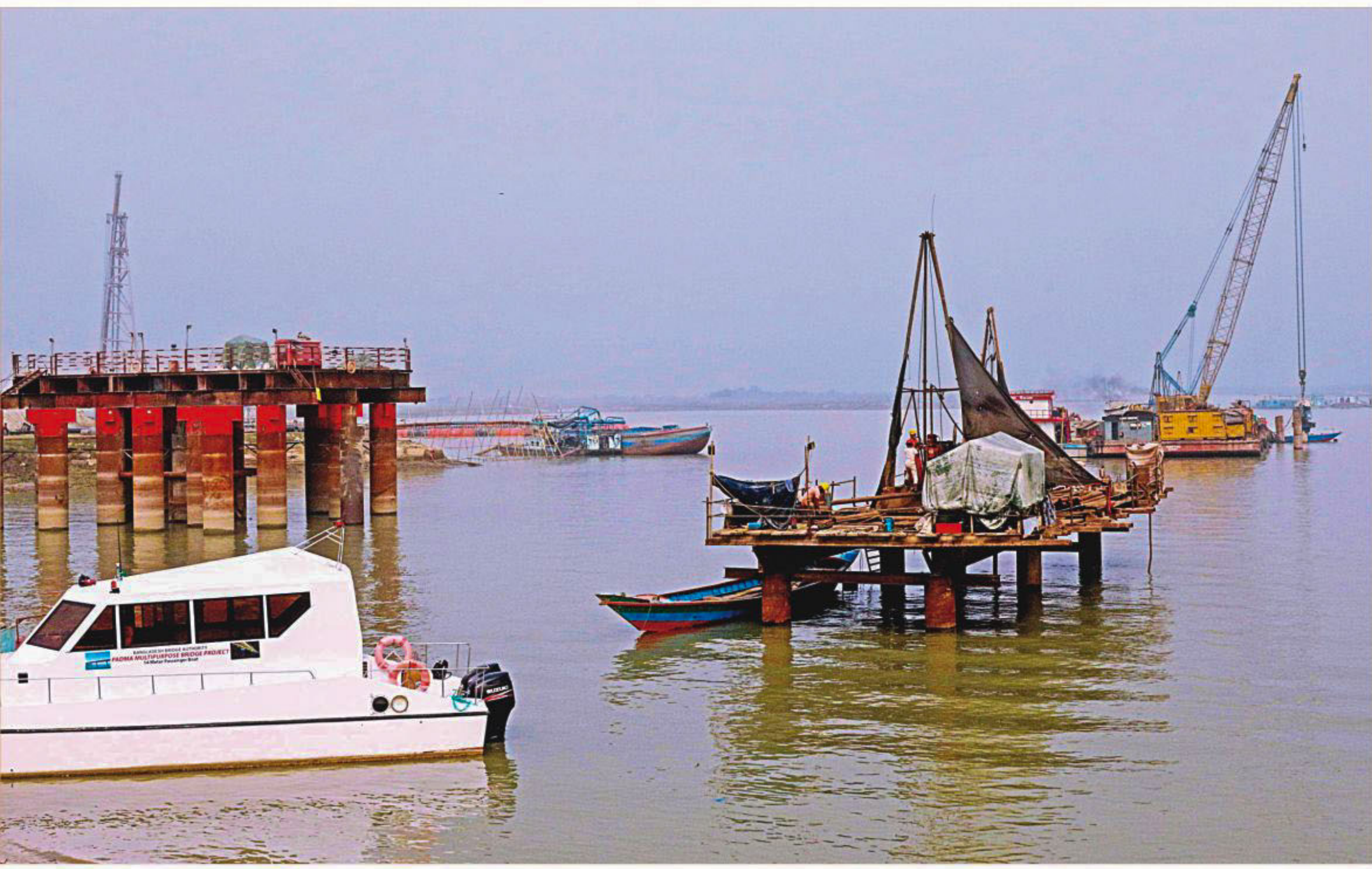
The soil of the riverbed being tested before the piling work for the Padma bridge begins. The photo was taken at Janjira of Shariatpur yesterday.