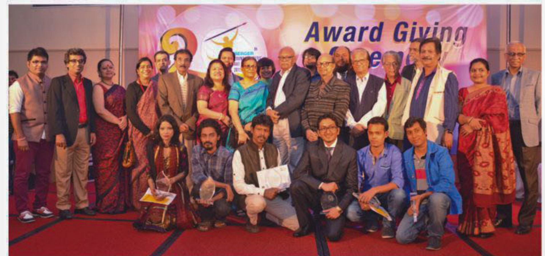
Participants and organisers at the award giving ceremony.