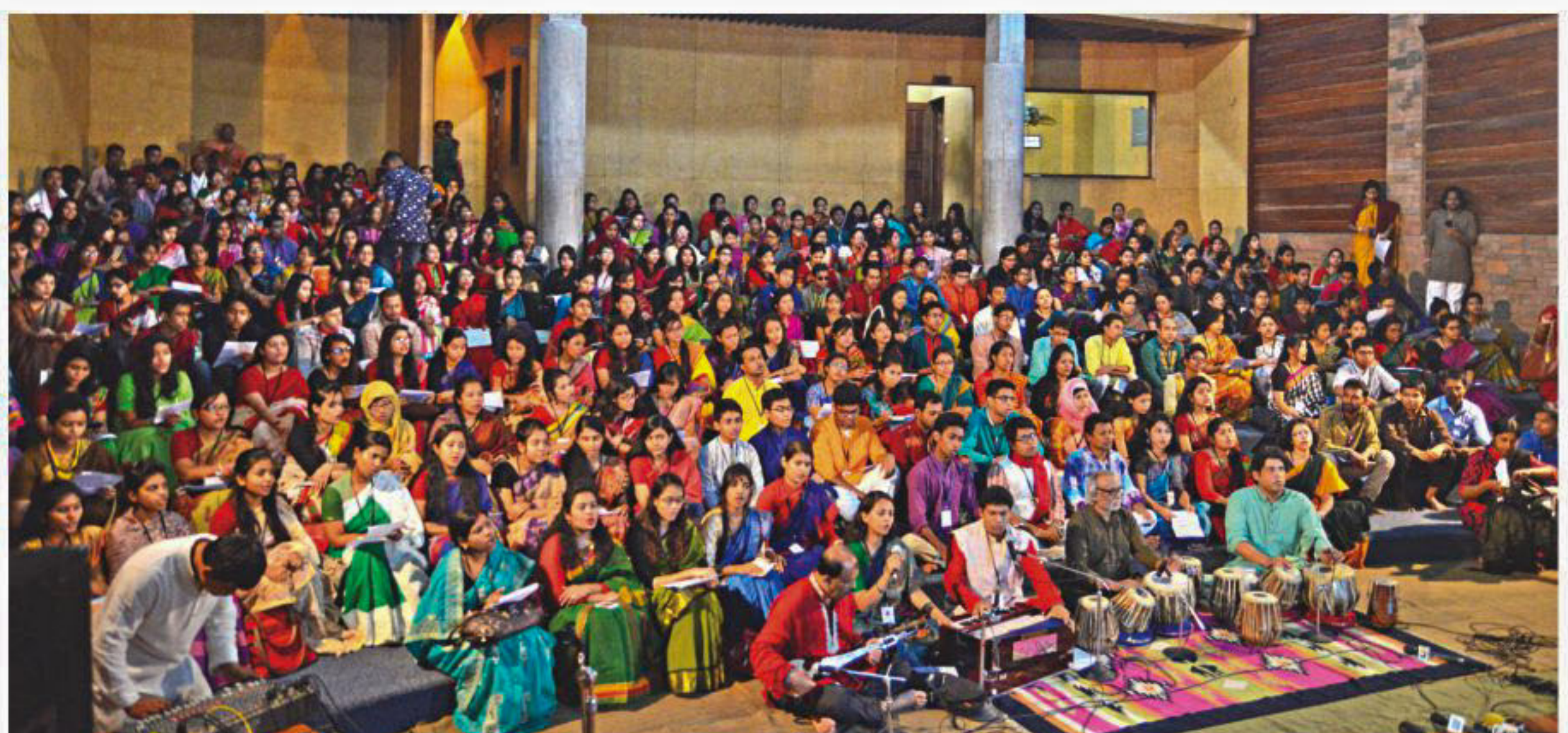
Artiste rehearse at Chhayanaut auditorium for the programme.

has transcended boundaries of the capital Dhaka to all across the country and the world, to become the biggest festival of Bangalees. Chhayanaut hopes that their new initiative to bring people together in the spirit of patriotism will be successful," the statement continued. A total of seven patriotic songs will be sung in chorus by young students and teachers of Chhayanaut at 3:50pm on the day, which organizers hope the audience will join in chorus. Rehearsal for the event is currently on at Chhayanaut.