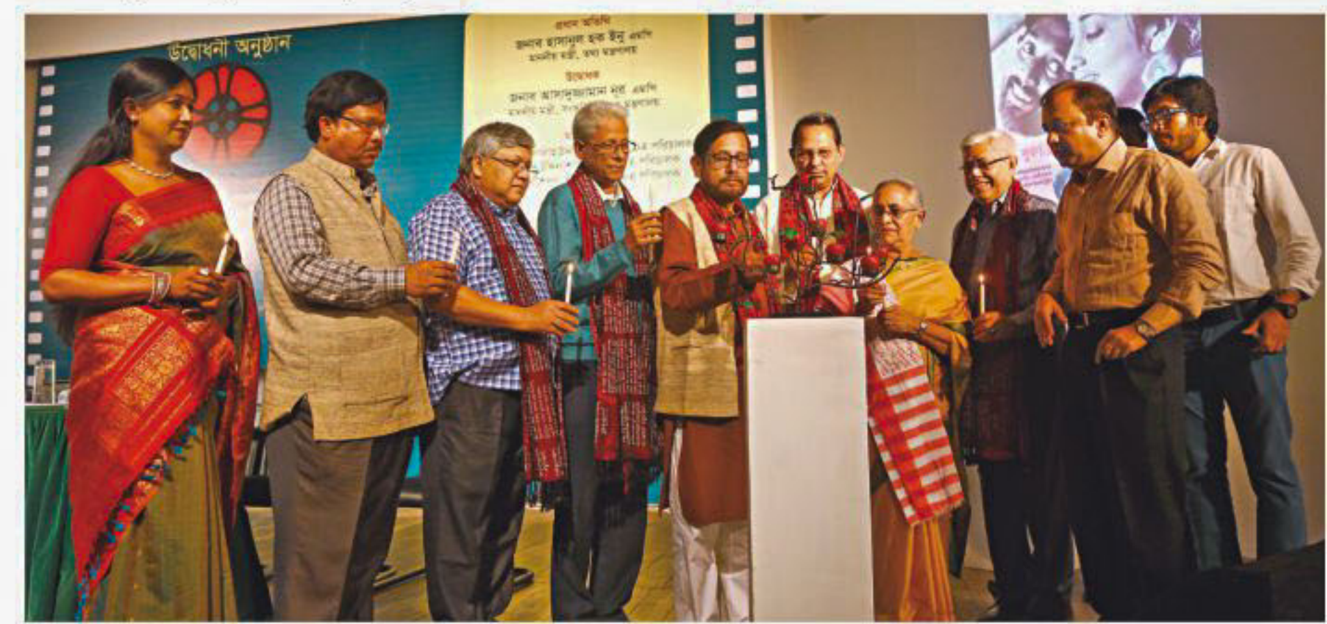
Guests inaugurate the festival.