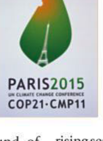
PARIS2015 CLIMATE CHANGE CONFERENCE COP21-CMP11

"We are almost at the end of the road and I am optimistic," said Fabius, whose hopes were echoed by many negotiators and observers despite potential deal-breakers still up in the air.