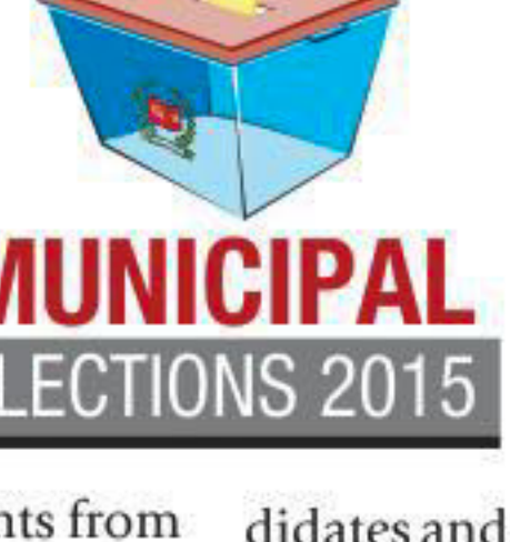
MUNICIPAL ELECTIONS 2015

On Wednesday night, the AL central command gave its rebels 24 hours to quit their mayoral bids to avoid facing actions, including expulsion. However, very few