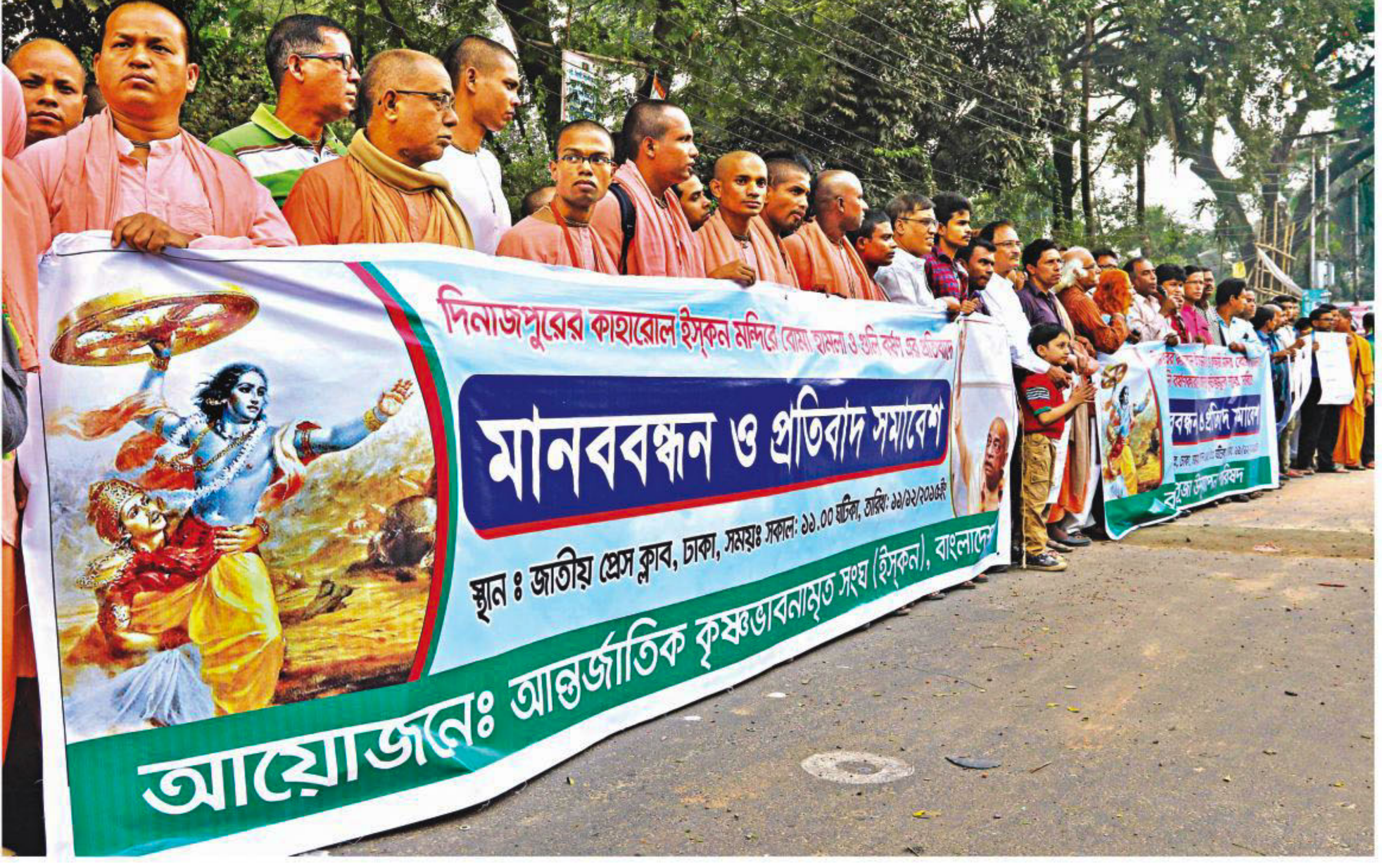
Members of many Hindu religious organisations under the banner of Bangladesh Jatiya Hindu Mahajote attend a rally in front of the capital's Jatiya Press Club yesterday, protesting the gun attack on the Iskcon mandir in Dinajpur on Thursday.