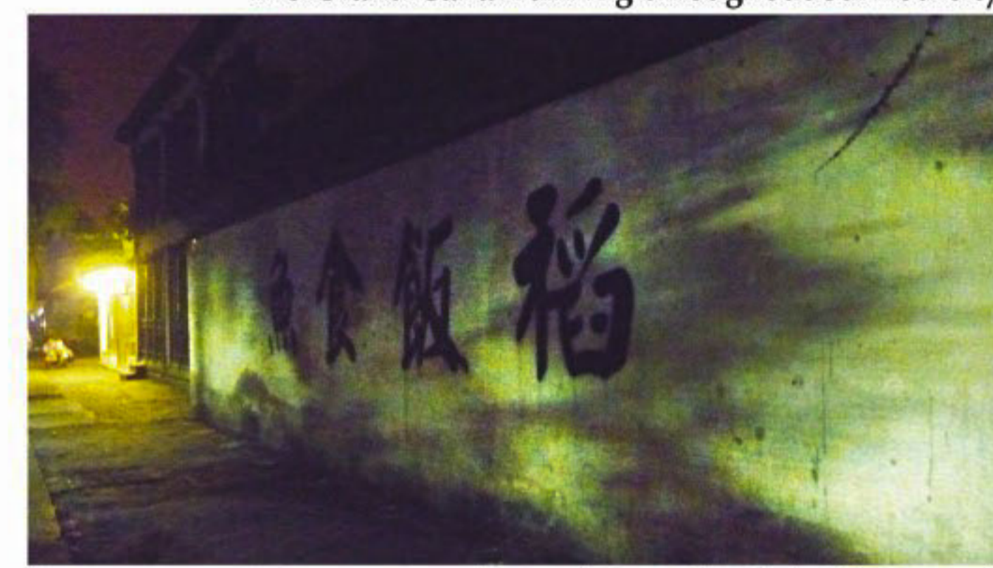
The ancient walls of Pingjiang Road.

Suzhou city, playing an important role in the One Belt, One Road initiative, taken by President Xi Jinping, houses some of the most busy and powerful industries in China. It has 147 companies that are Fortune 500 listed. The Taicang Port boasts the largest timber import in all of China. The Wujiang Dingsheng Silk Co. Ltd or Saint Joy has not only provided traditional Chinese clothes designed for the political leaders and their spouses who