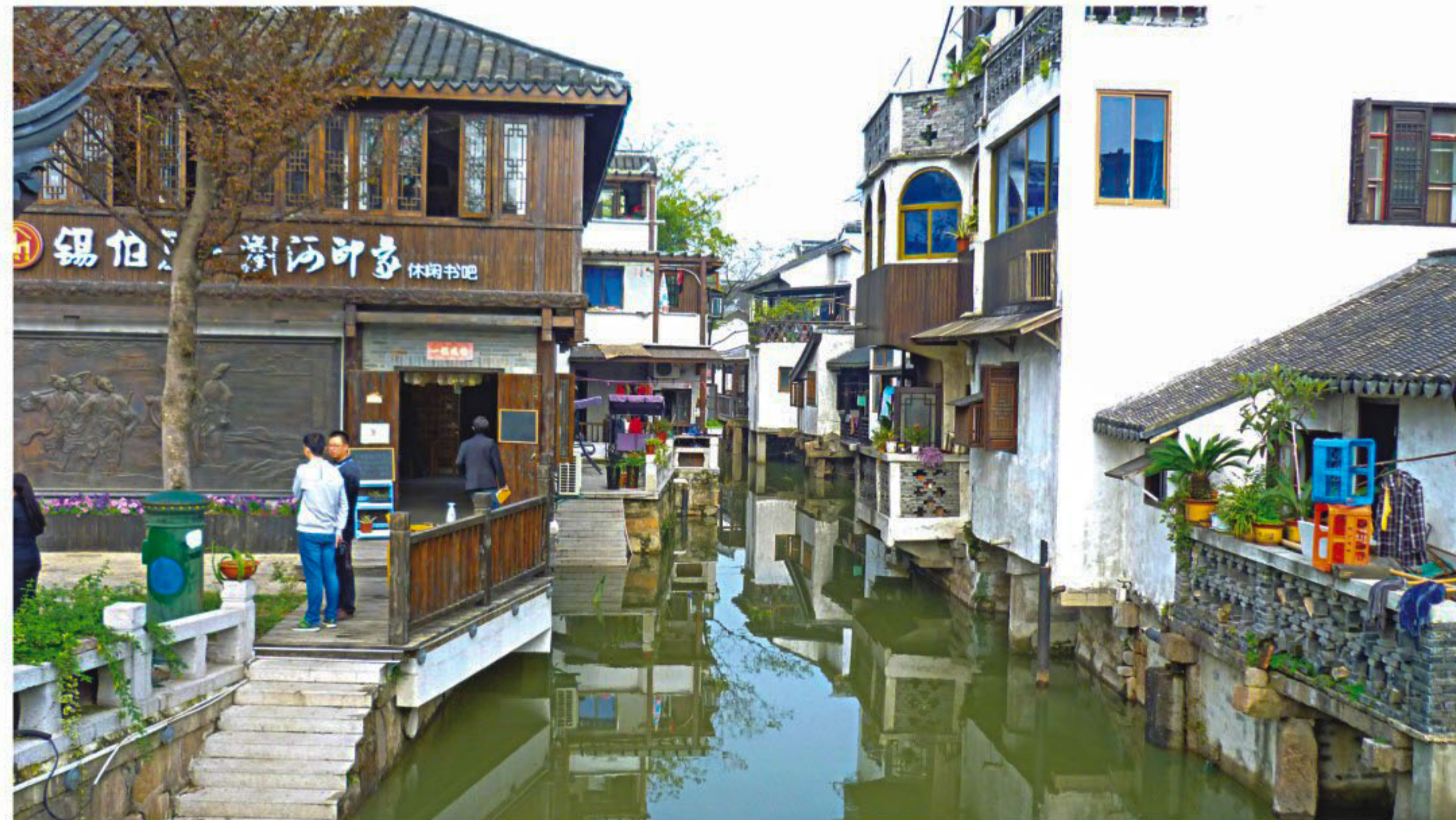
The Grand Canal running throughout Suzhou city.

Built in 514 BC, this ancient city has a history of 2,600 years. The characteristics of the past, unique as they were, are still retained today. The double-chessboard layout of the city, with the streets and rivers going side by side, while the water and land routes run in parallel, is remains unbroken. The mild climate makes the city an even more desirable destination, all year around. Their rich history is celebrated throughout the city as you will come across the Zheng He theme park, highlighting his famous historic voyage. The Palace of Heavenly Concubine in Liuhe Town and the Tianfei Palace of Goddess Mazou will transport you back to the past where you can interact