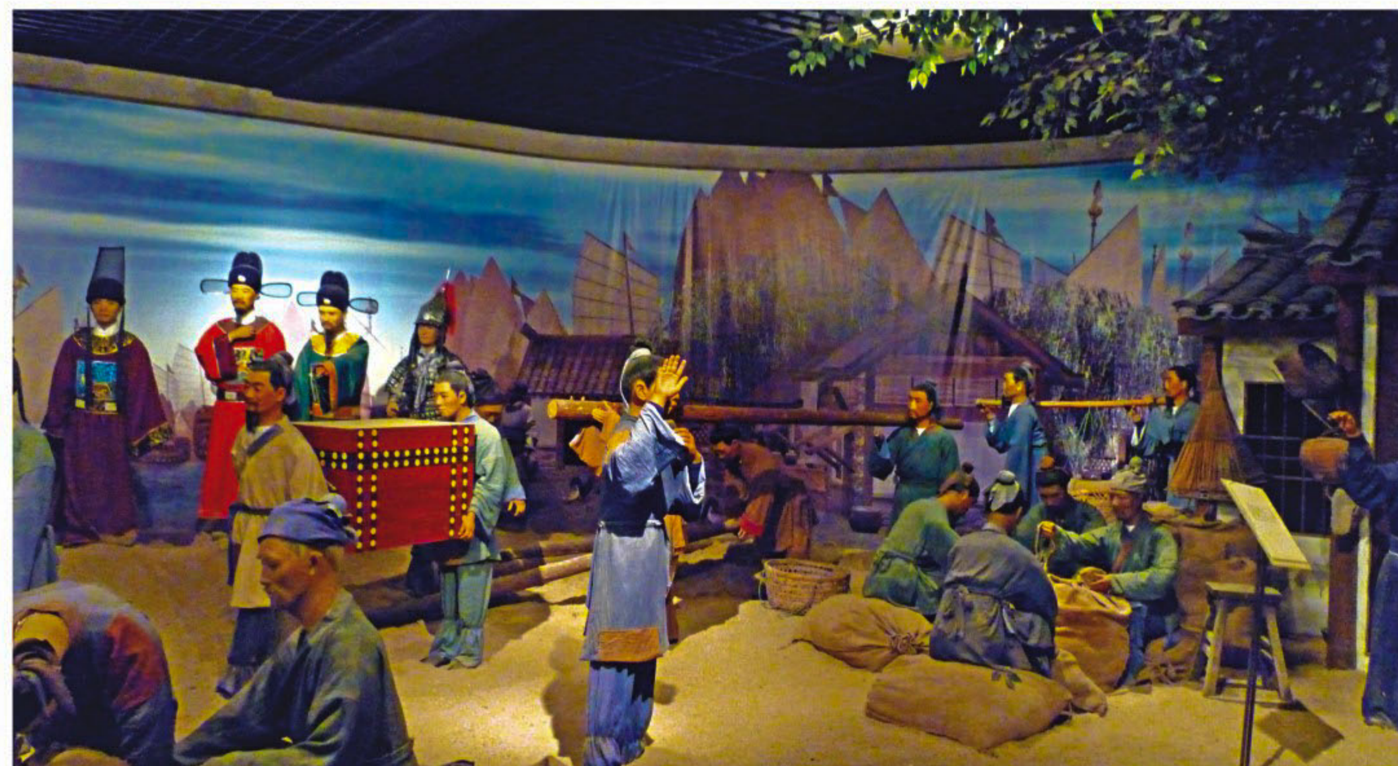
Inside the Zheng He theme park.