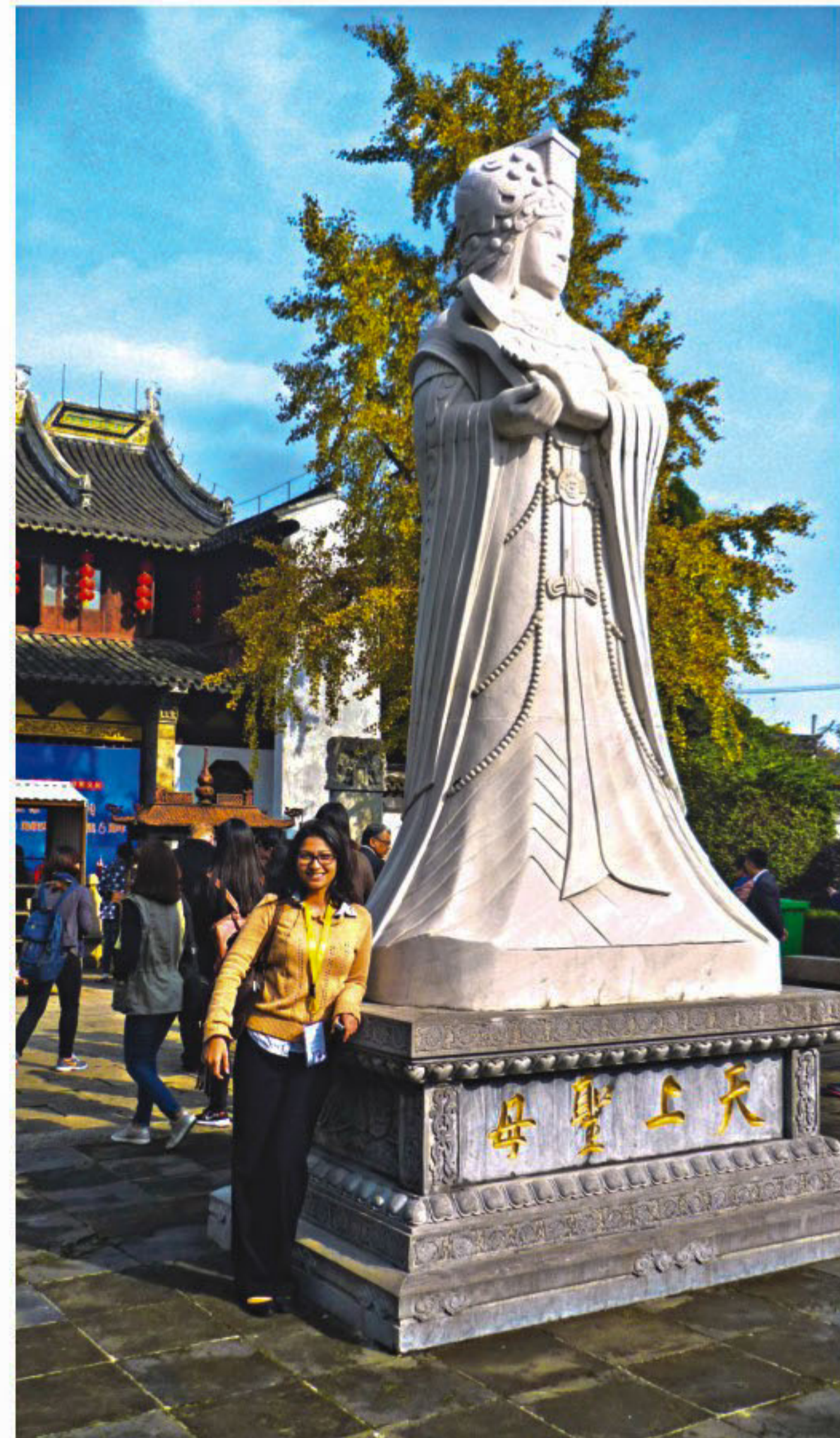
The statue of Goddess Mazou at the Tianfei Palace.